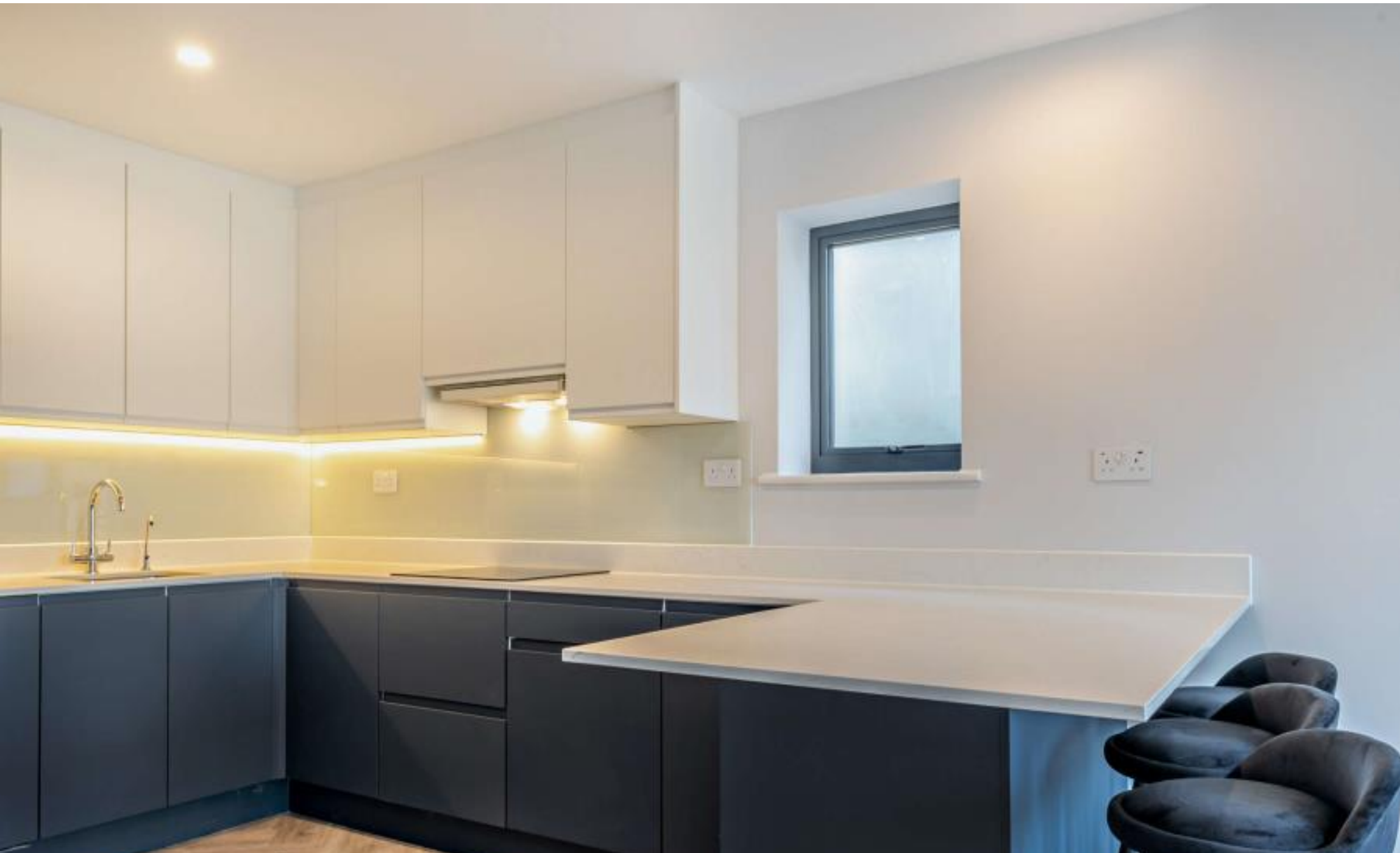
A luxury apartment in a convenient location Bury Street, Ruislip, Middlesex HA4 7TL