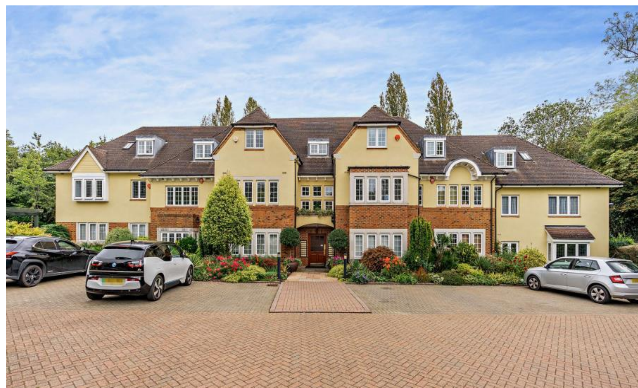
A three bedroom ground floor apartment in a gated development Ducks Hill Road, Northwood, HA6 2SG