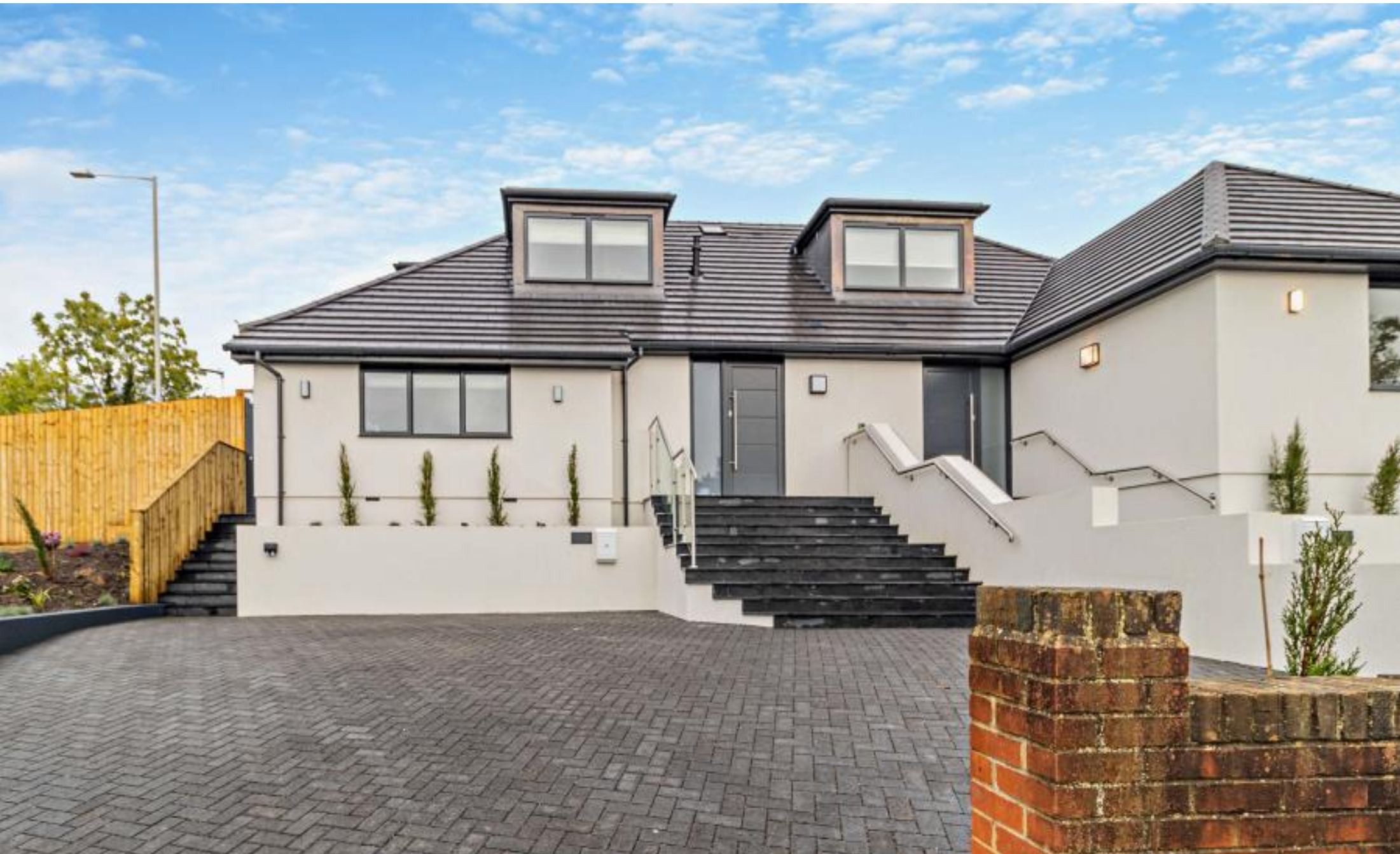
A new three bedroom stylish family home in a sought after location The Circuits, Pinner, Middlesex HA5 2BD