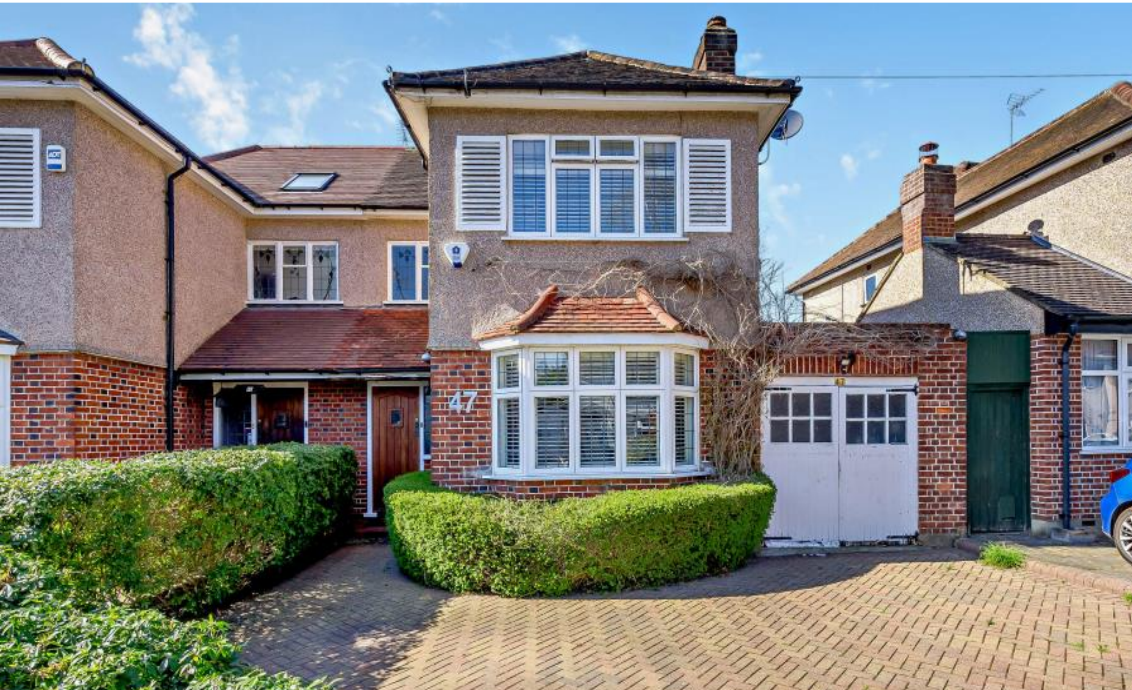
A BEAUTIFULLY PRESENTED THREE BEDROOM, TWO BATHROOM HOUSE St Michael's Crescent, Pinner, HA5 5LE