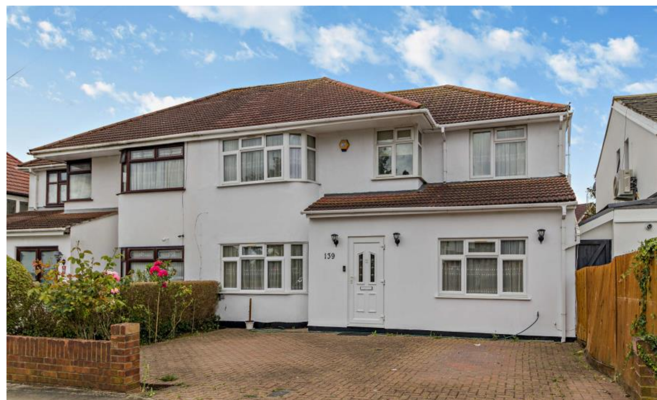
A well-proportioned six bedroom, two bathroom family home Woodlands, North Harrow, HA2 6EN