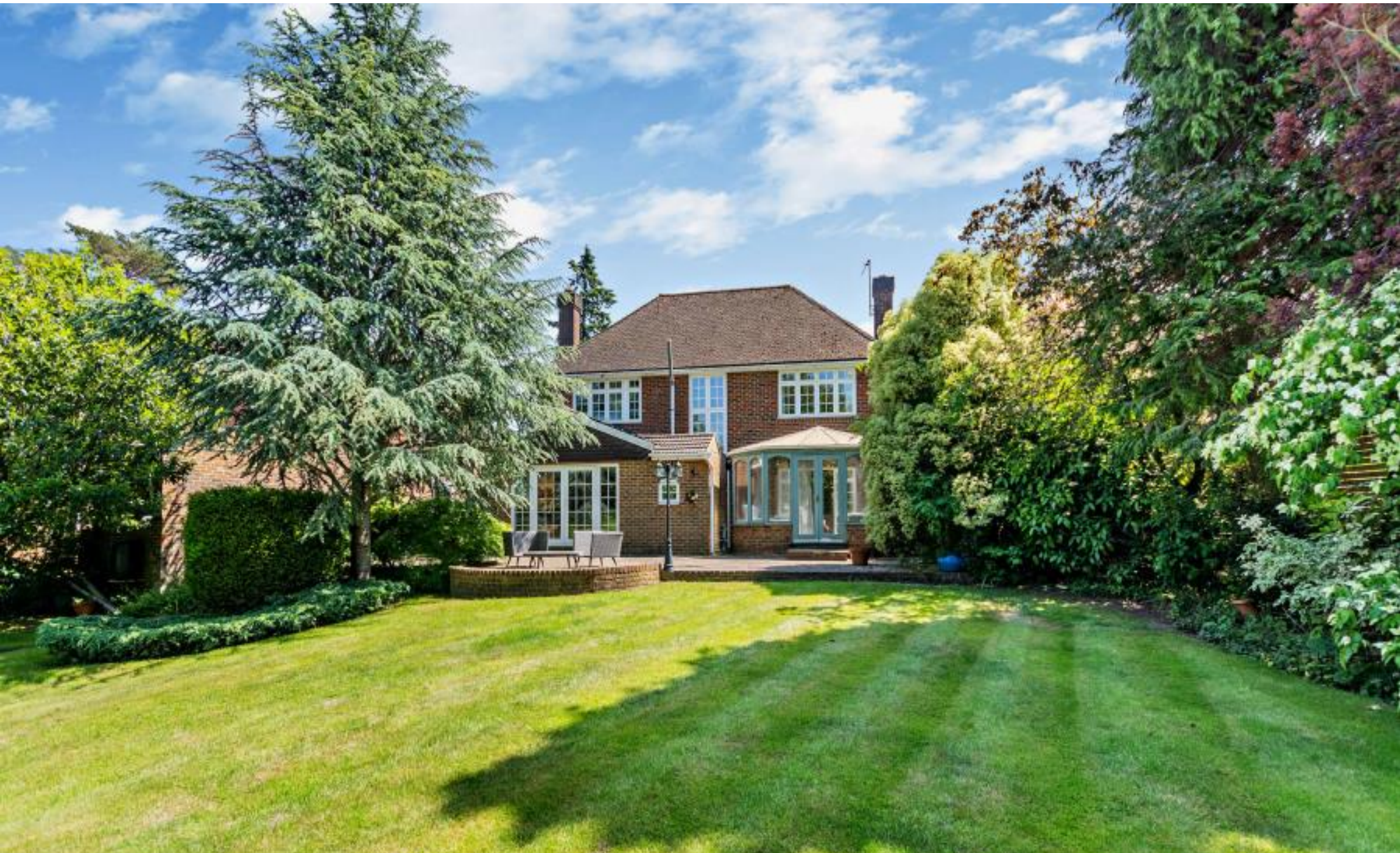
A charming, rarely available four bedroom, two bathroom detached family home Old Hall Close, Pinner, HA5 4ST