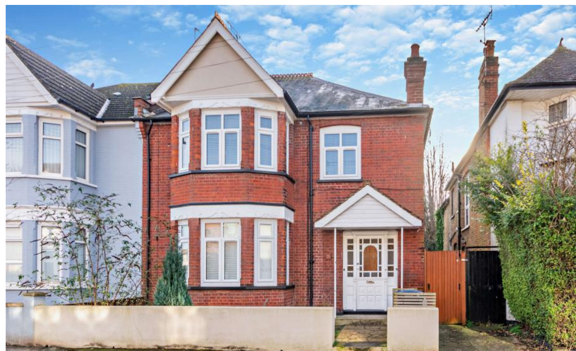
A spacious ground floor maisonette with private garden Mildred Avenue, Watford, WD18 7DU