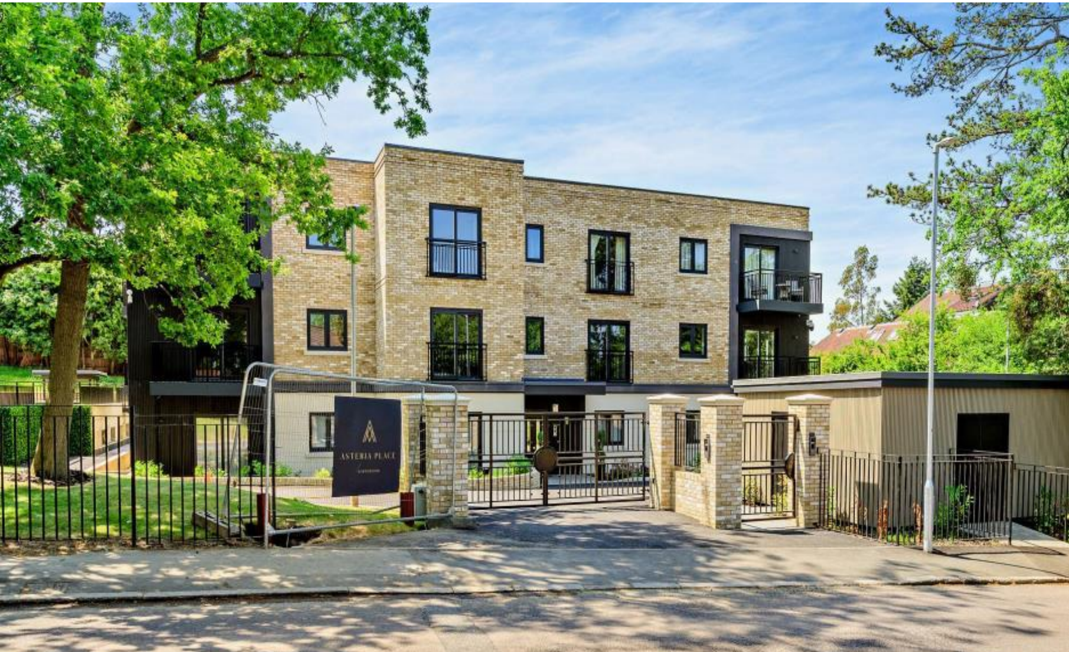
Brand New Luxury Apartment Situated Within An Exclusive Gated Development Eastbury Avenue, Northwood, Middlesex HA6 3FL