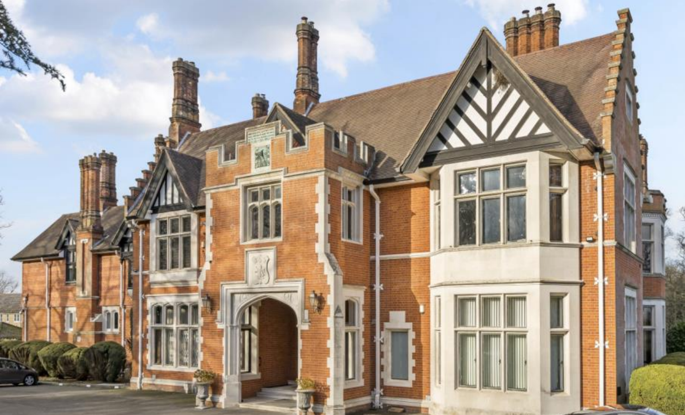
A beautifully presented three bedroom, two bathroom top floor apartment Chorleywood House Drive, Chorleywood, WD3 5FL