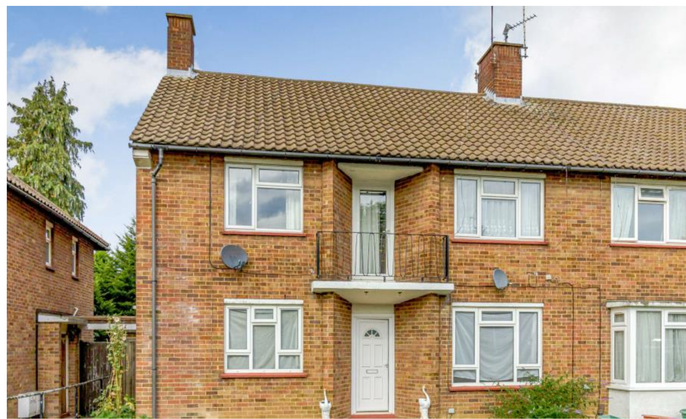
A two bedroom ground floor maisonette with a private rear garden Ellement Close, Pinner, HA5 1EP