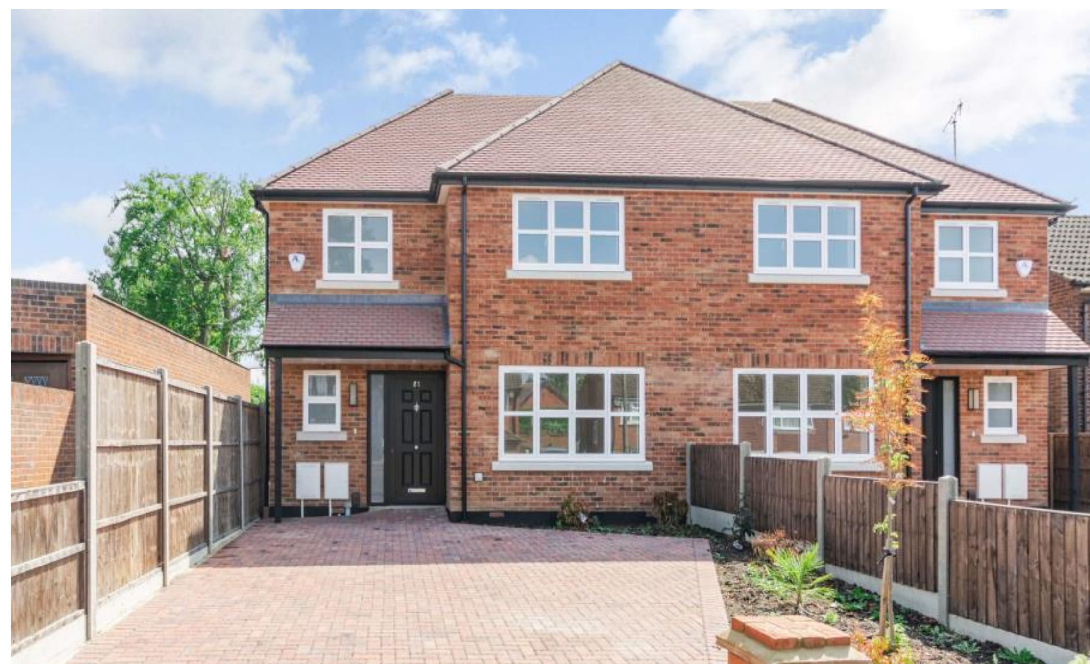
A brand new three bedroom, two bathroom semi-detached house Hare Crescent, Watford, Hertfordshire WD25 7EE