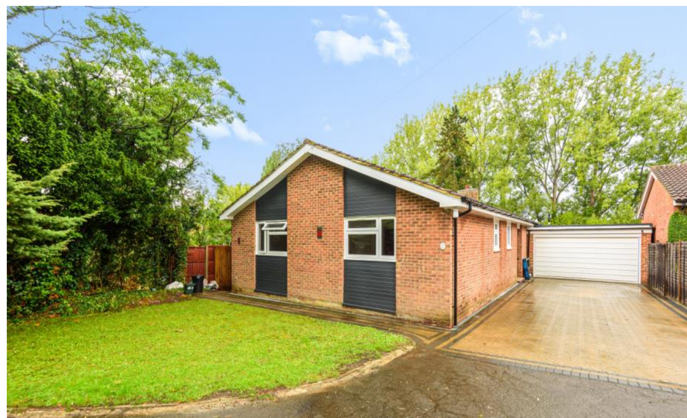
A sizeable detached four bedroom bungalow The Drive, Northwood, HA6 1HP