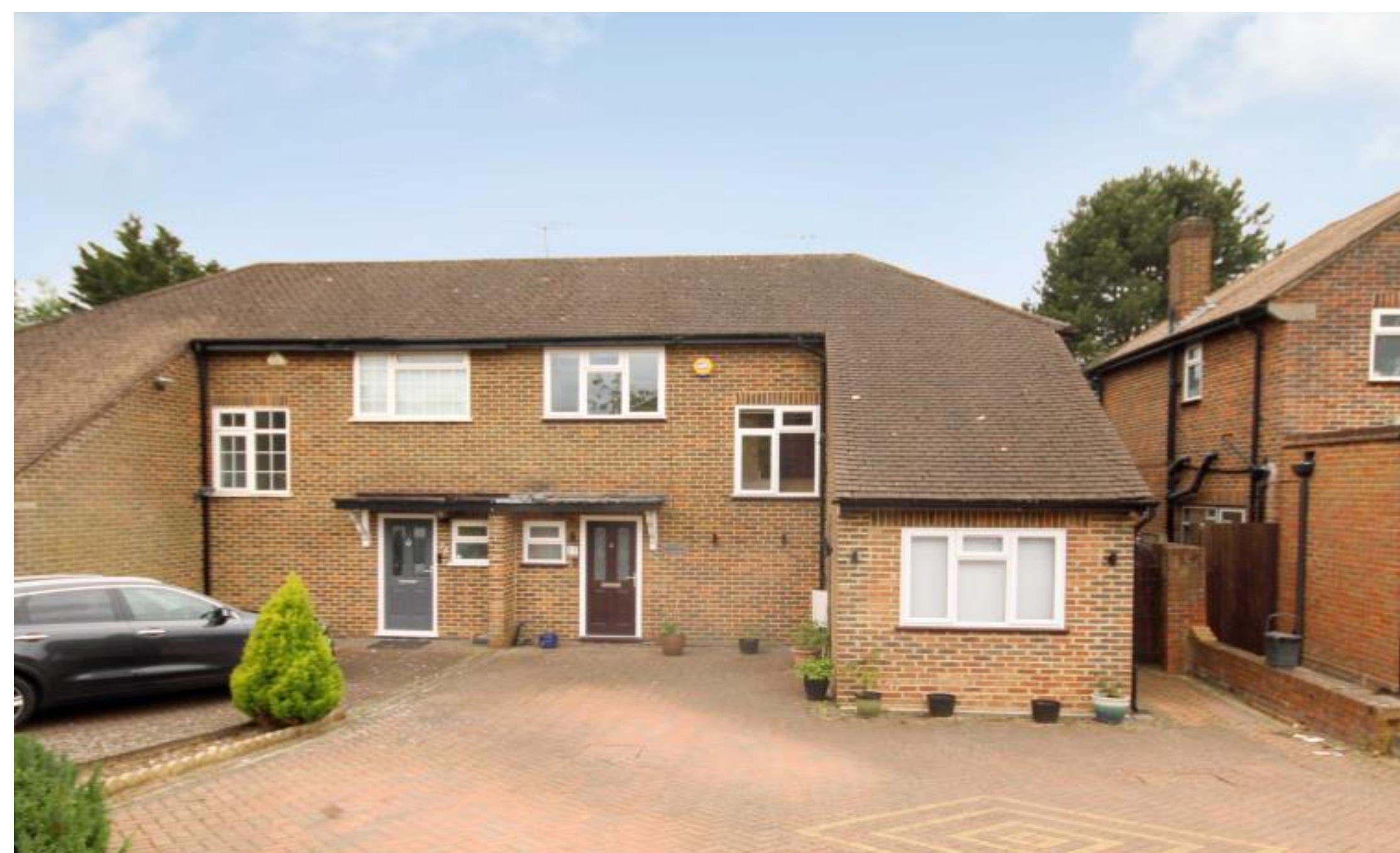
A four bedroom family home in a popular location Norman Crescent, Pinner, Middlesex HA5 3QH