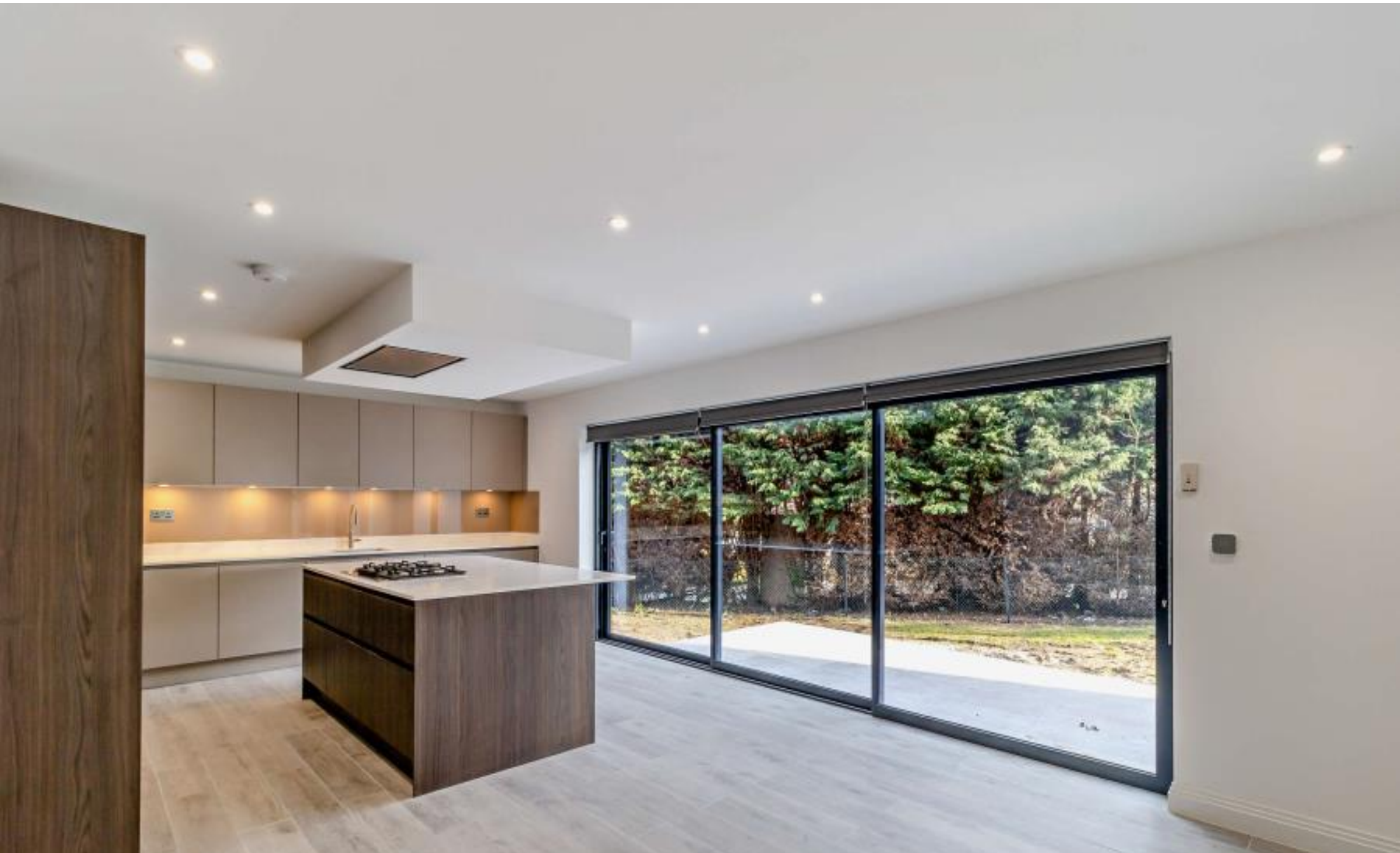
A immaculate refurbished four bedroom house on the private Moor Park Estate Wolsey Road, Northwood, Middlesex HA6 2ER