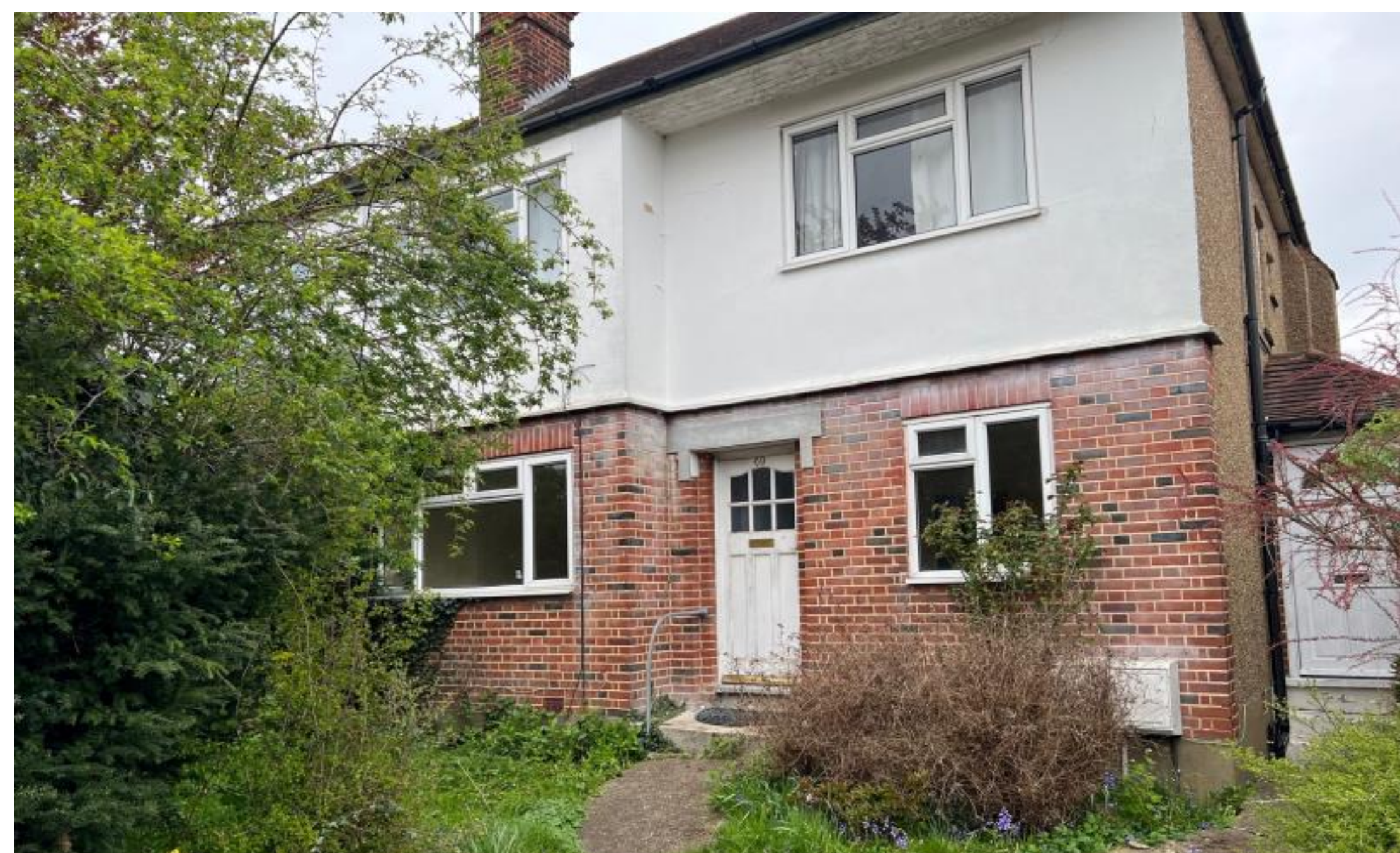
A well presented ground floor two bedroom maisonette Tolcarne Drive, Pinner, Middlesex HA5 2DH