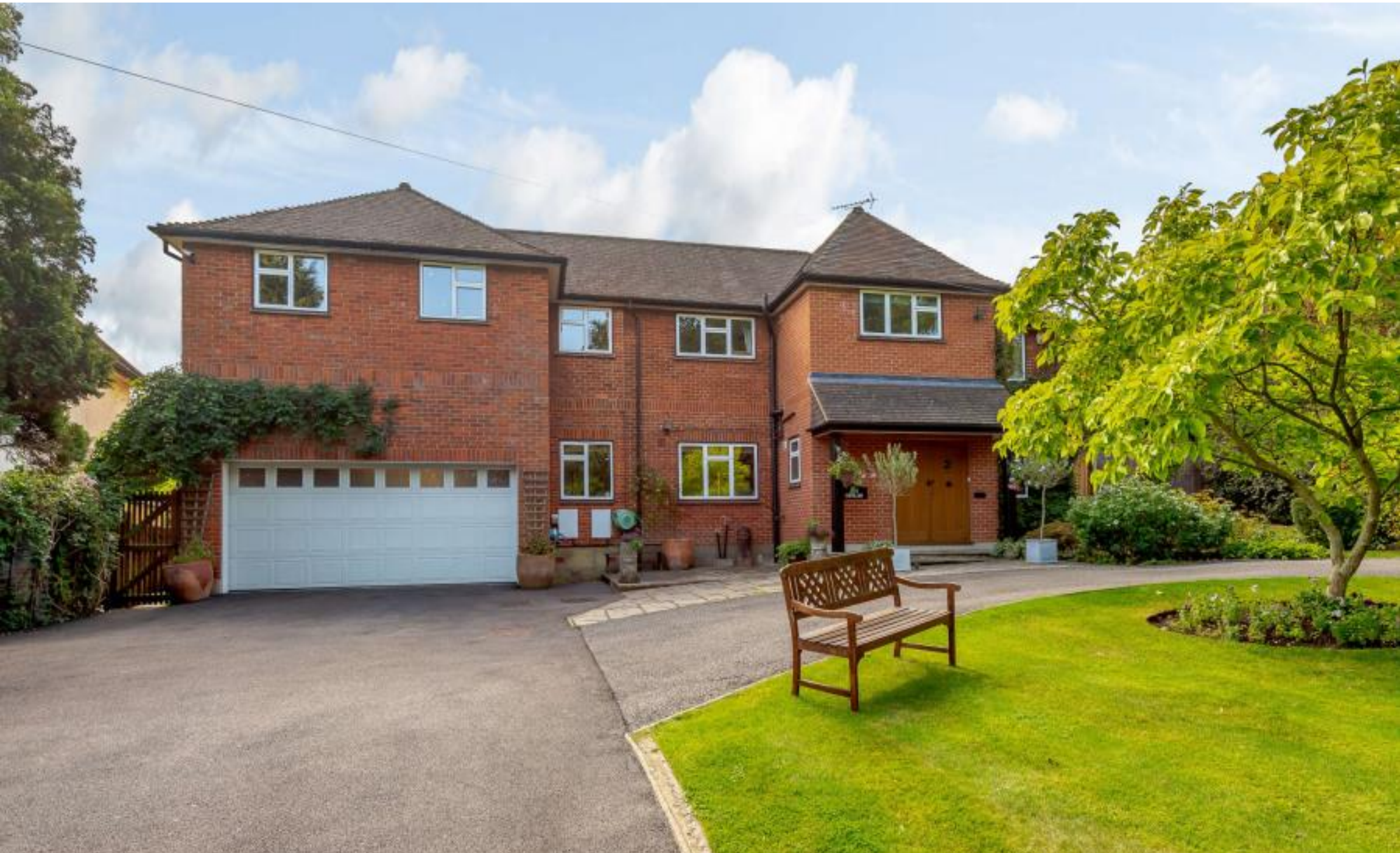
An outstanding five bedroom, three bathroom detached family home Farm Road, Northwood, Middlesex HA6 2NZ