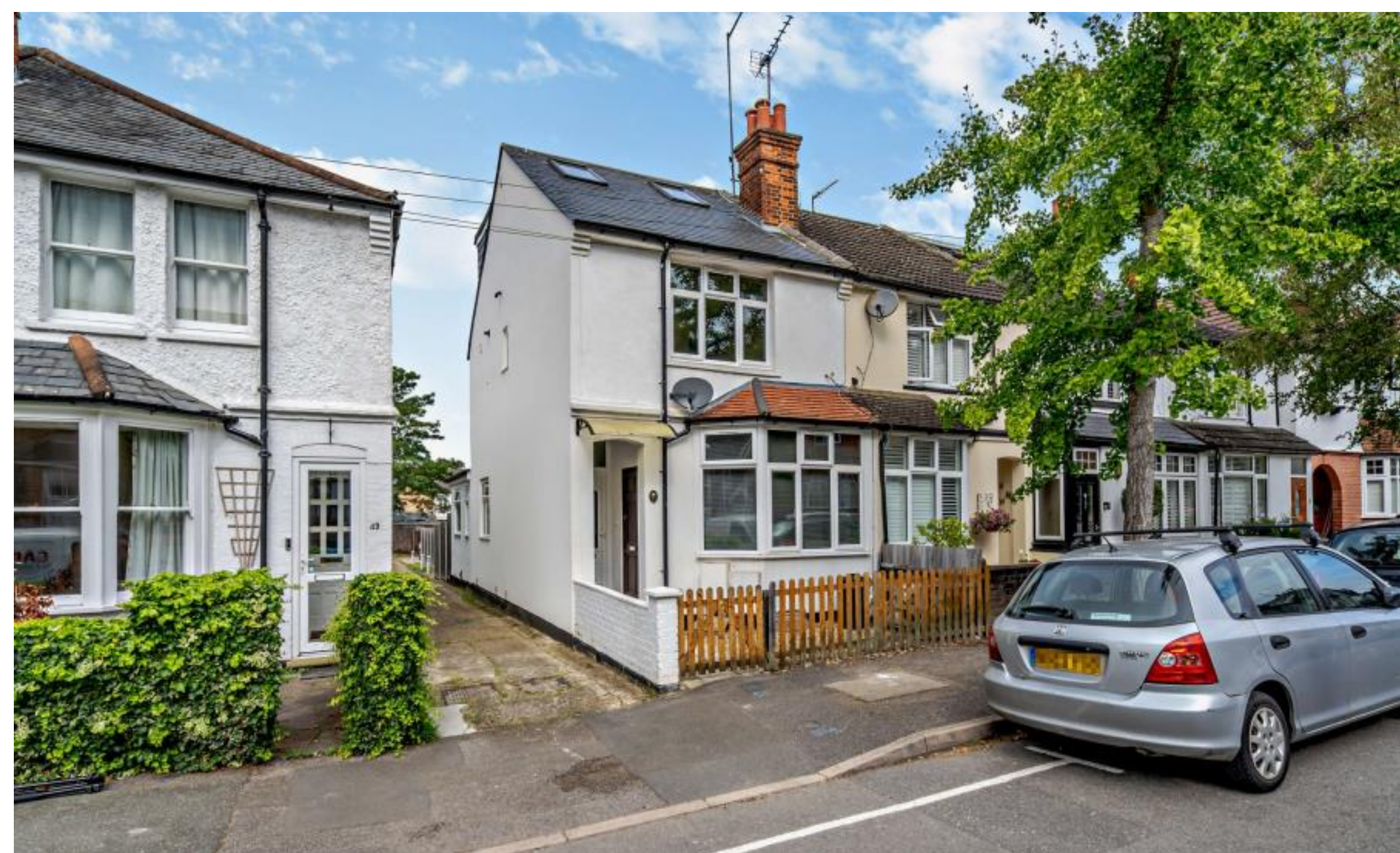
A two bedroom duplex apartment with private rear garden Hilliard Road, Northwood, HA6 1SJ