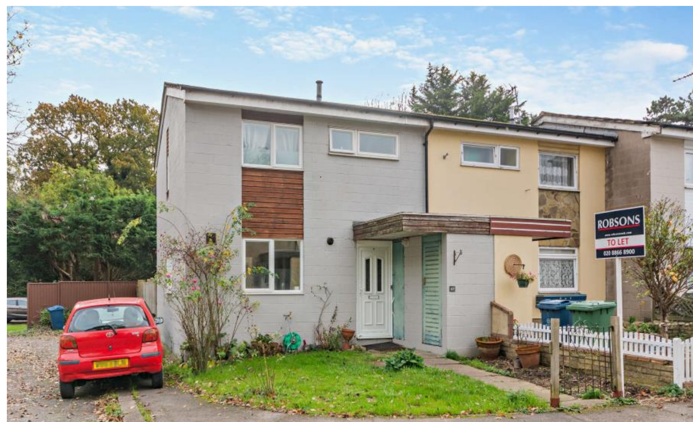
A charming end of terrace three bedroom family home in a cul-de-sac location Antoneys Close, Pinner, HA5 3LP