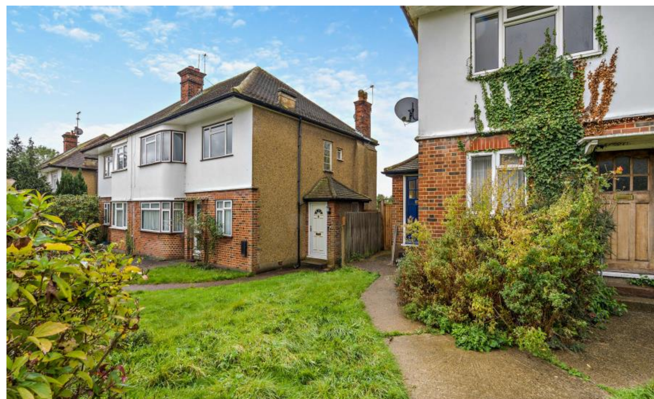
A well presented first floor two bedroom maisonette Tolcarne Drive, Pinner, HA5 2DQ