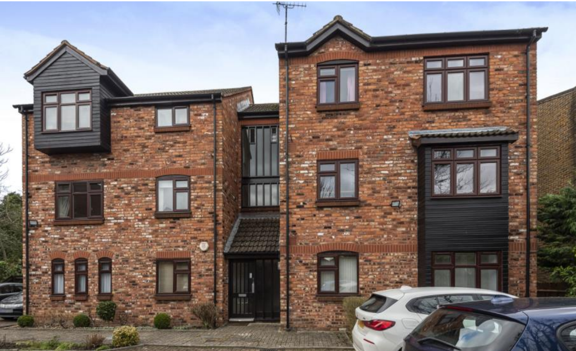
A well presented two bedroom ground floor apartment Glenshee Close, Northwood , HA6 2UH