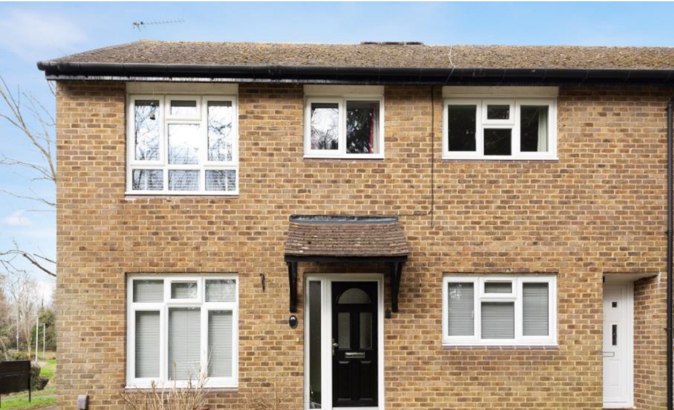
A very well presented one bedroom ground floor maisonette St Catherines Farm Court, Ruislip, HA4 7YH