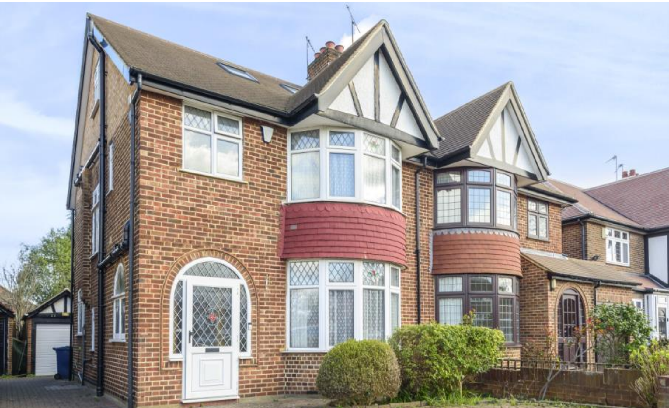
A stylish and modern five bedroom semi-detached family home. George V Avenue, Pinner, HA5 5SW