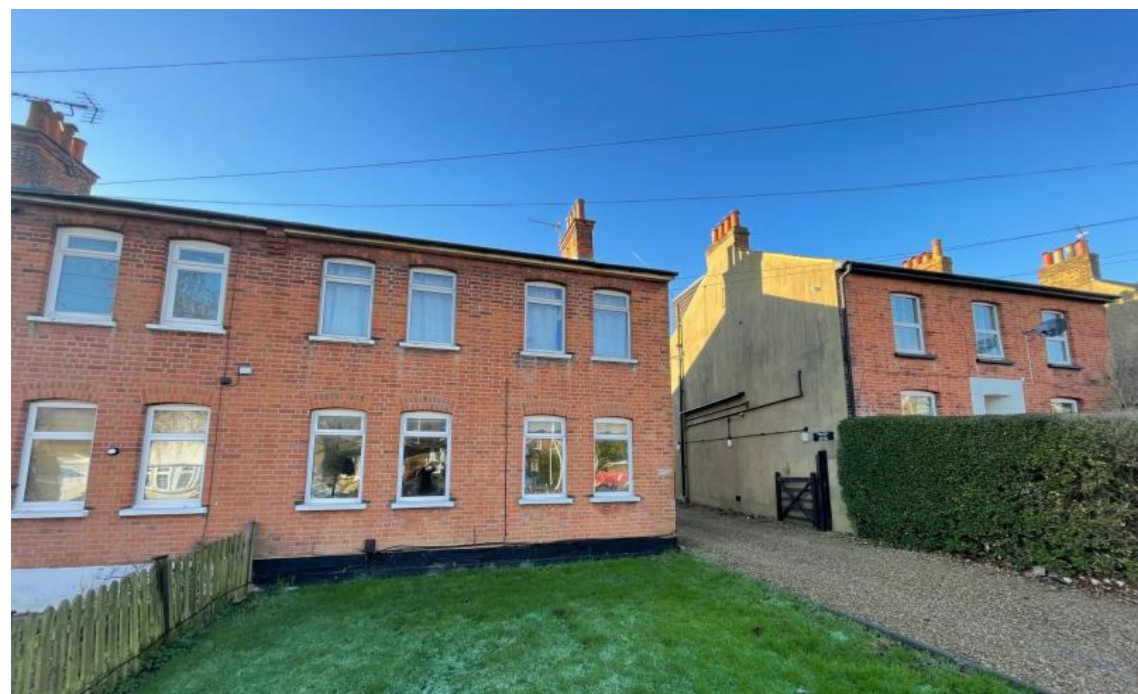
A modern and well presented two bedroom ground floor flat Hallowell Road, Northwood, Middlesex HA6 1DU