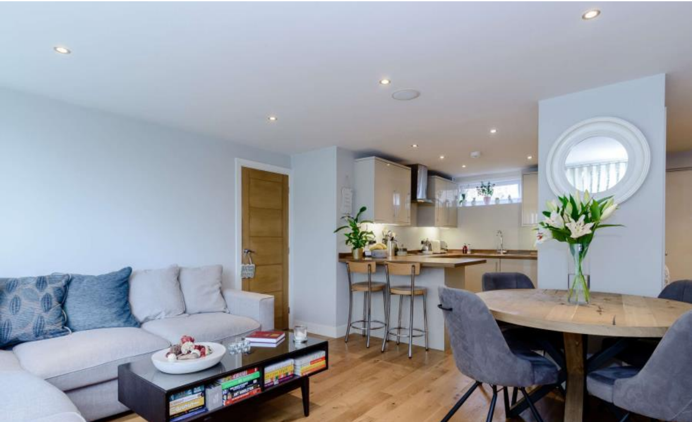
An immaculate two bedroom ground floor apartment Dormans Close, Northwood, HA6 2FX