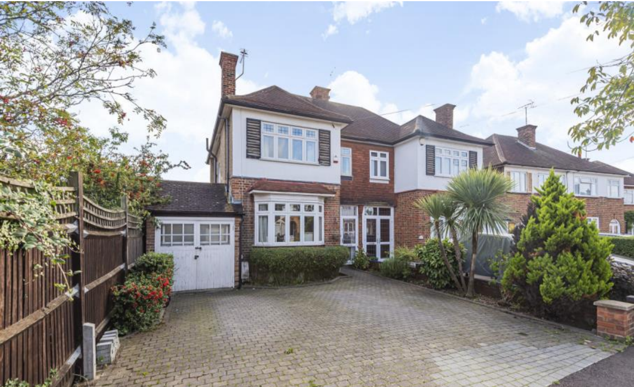
An attractive three/four bedroom two bathroom semi detached home Parkthorne Drive, Harrow, Middlesex HA2 7BU