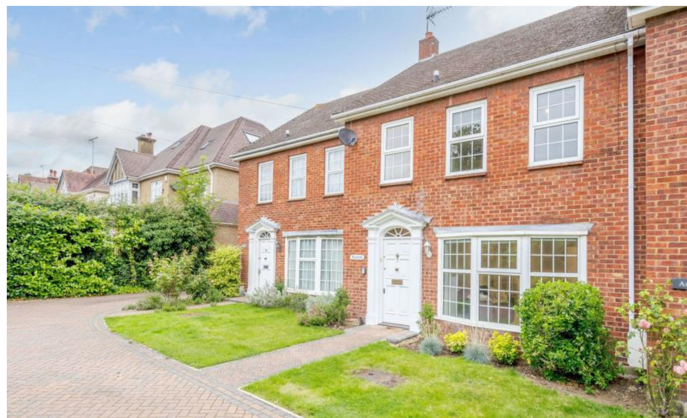
A delightful two bedroom mid-terraced house in Northwood Rickmansworth Road, Northwood, Middlesex HA6 2RF