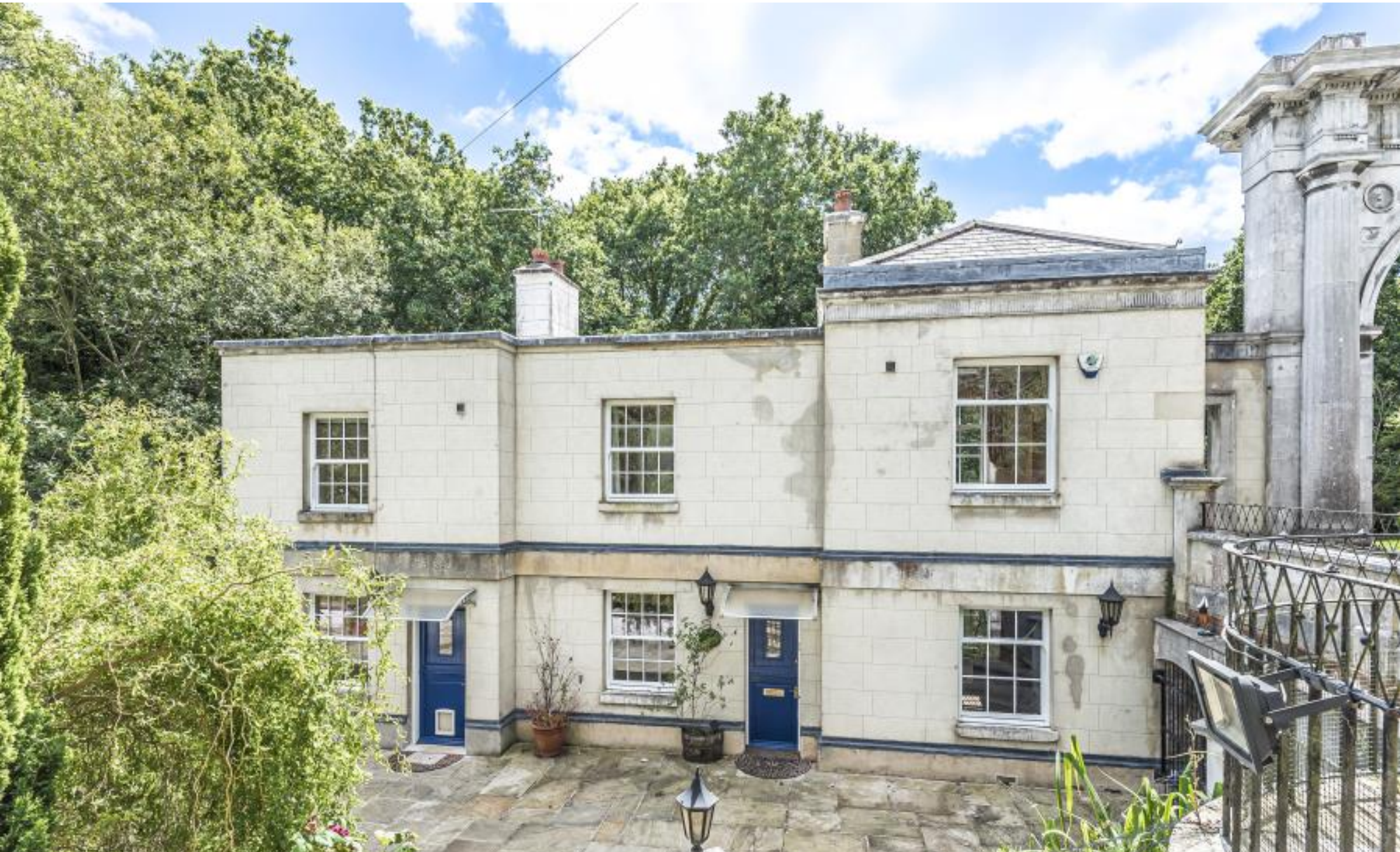
A unique grade II listed property Batchworth Heath, Rickmansworth, Herts WD3 1QB