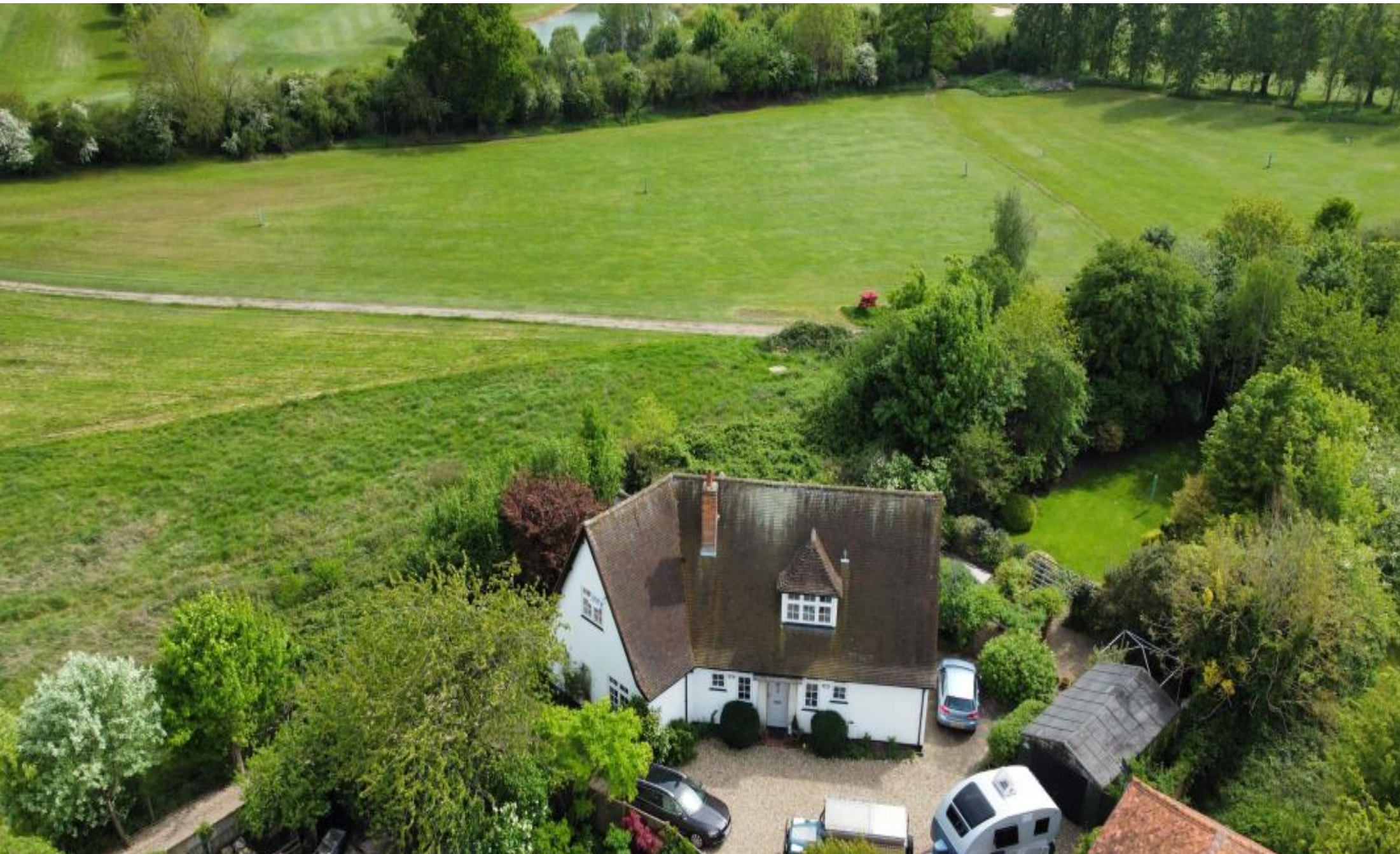
A modern detached chalet style home set within beautiful grounds Moor Park Farm House, Rickmansworth, Hertfordshire WD3 1JS