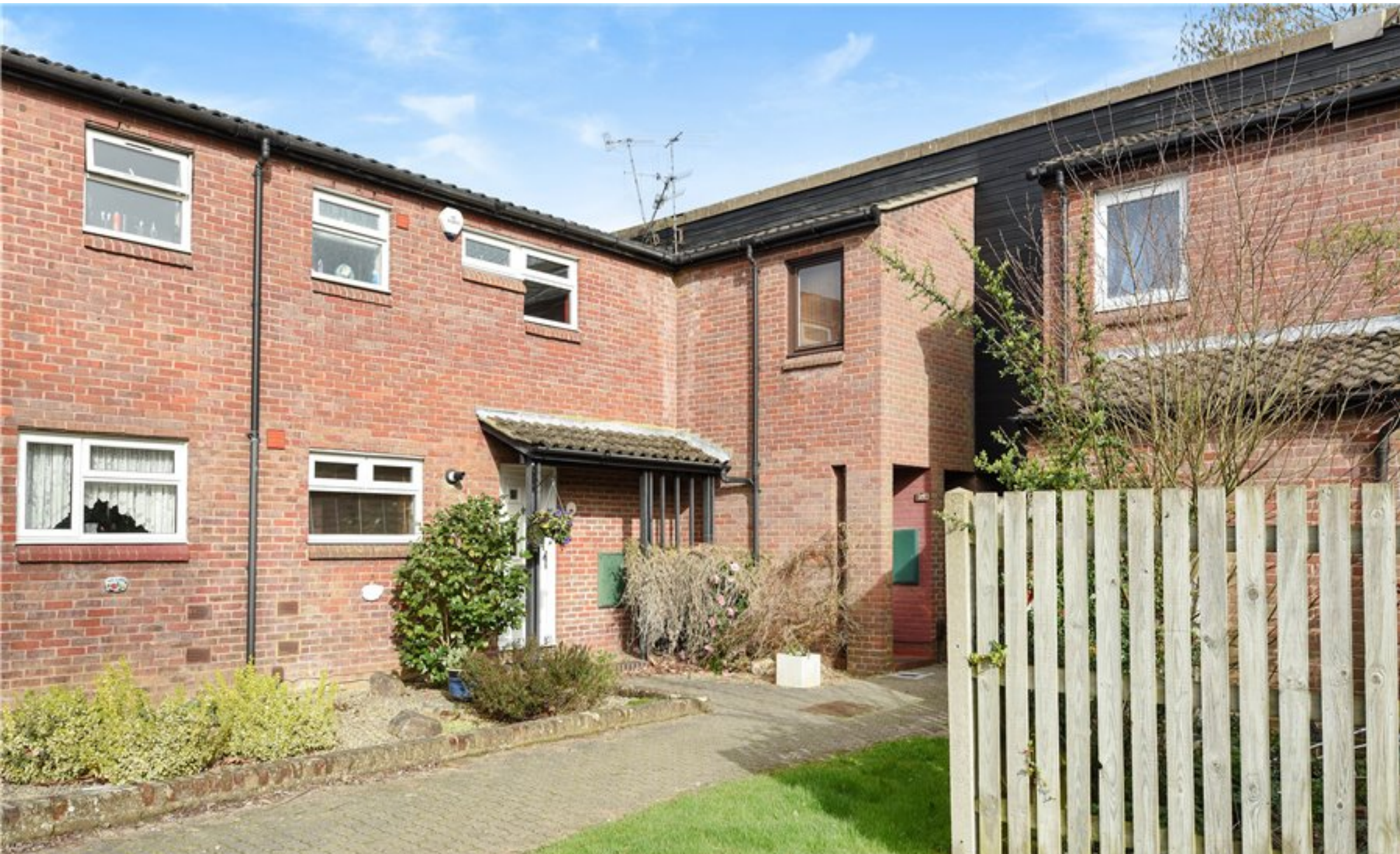
A beautifully presented one bedroom ground floor maisonette Mezen Close, Northwood, Middlesex HA6 2DP