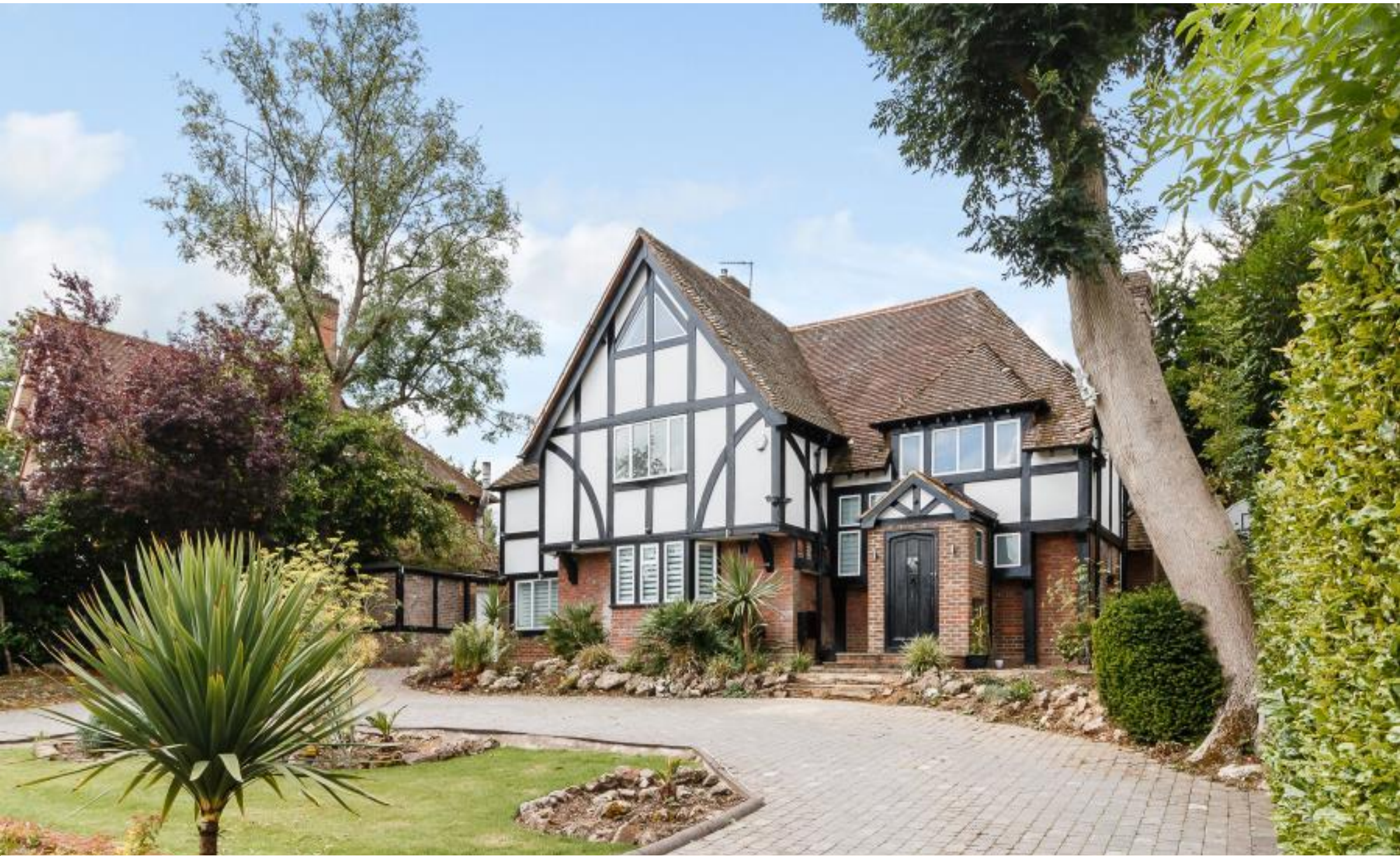
A Stunning Six Bedroom, Six Bathroom, Detached Family Home Astons Road, Northwood, Middlesex HA6 2LD