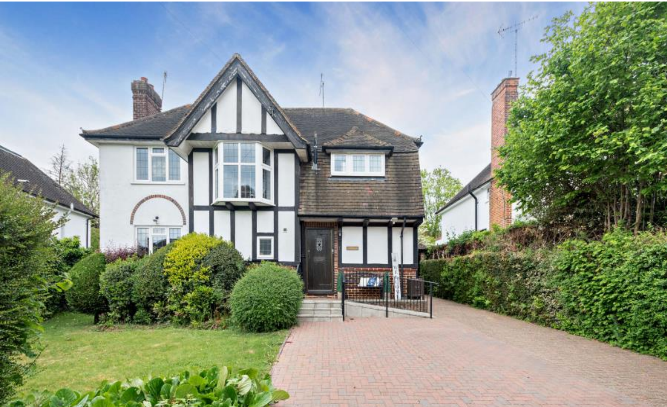
A well-presented four-bedroom family home Grosvenor Road, Northwood, Middlesex HA6 3HH