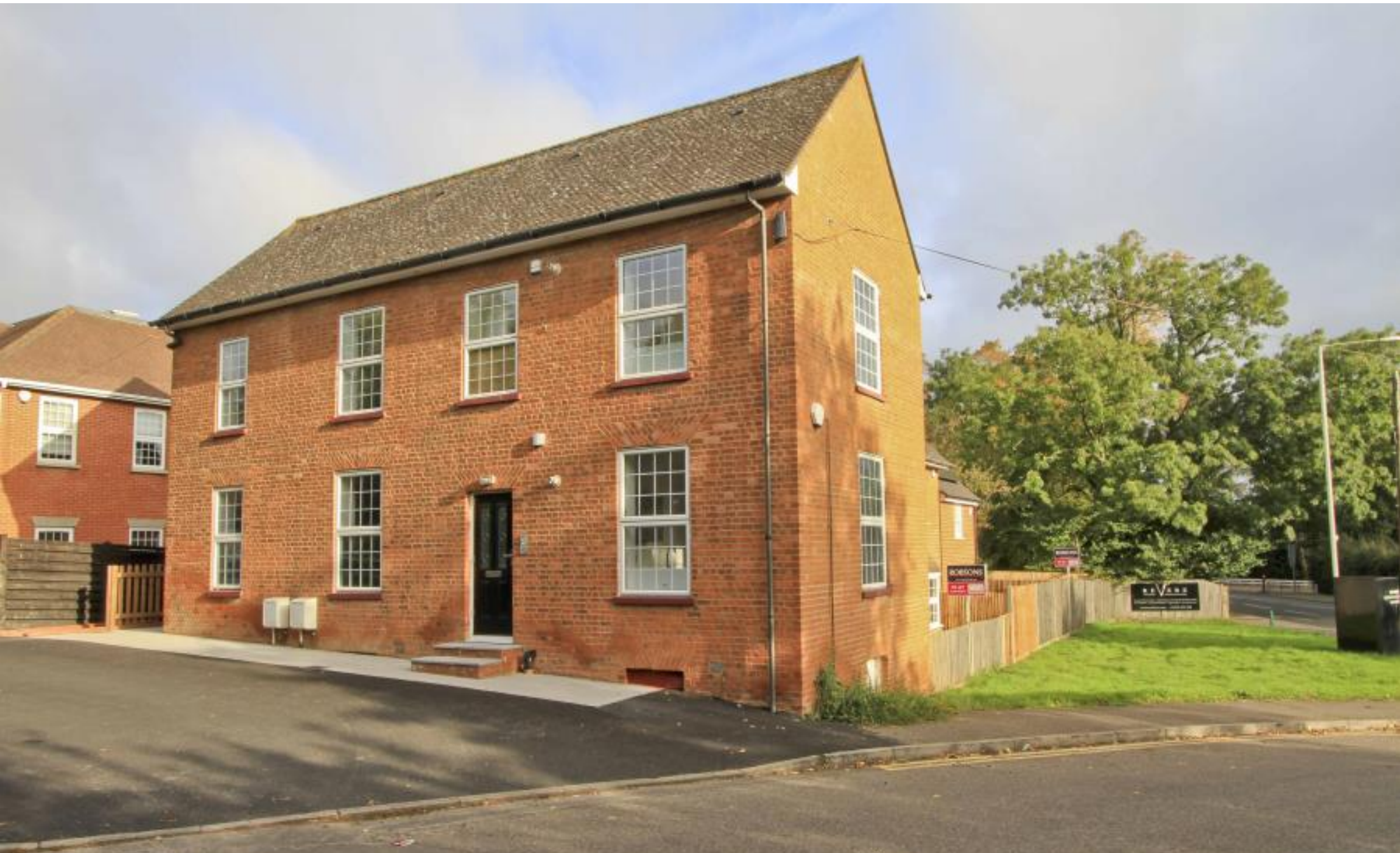
A two bedroom house in a convenient location Ducks Hill Road, Northwood, Middlesex HA6 2NP