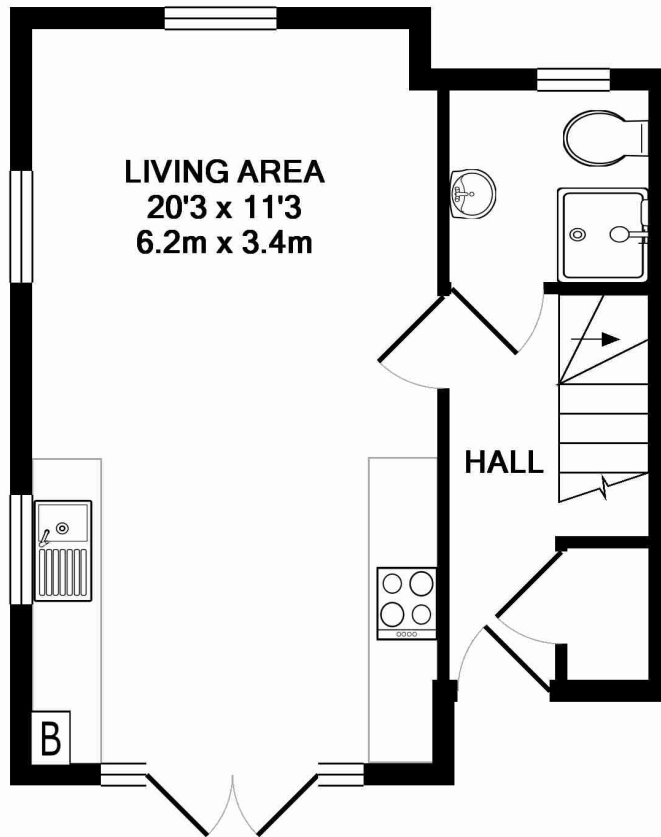
GROUND FLOOR APPROX. FLOOR AREA 321 SQ.FT. (29.9 SQ.M.)