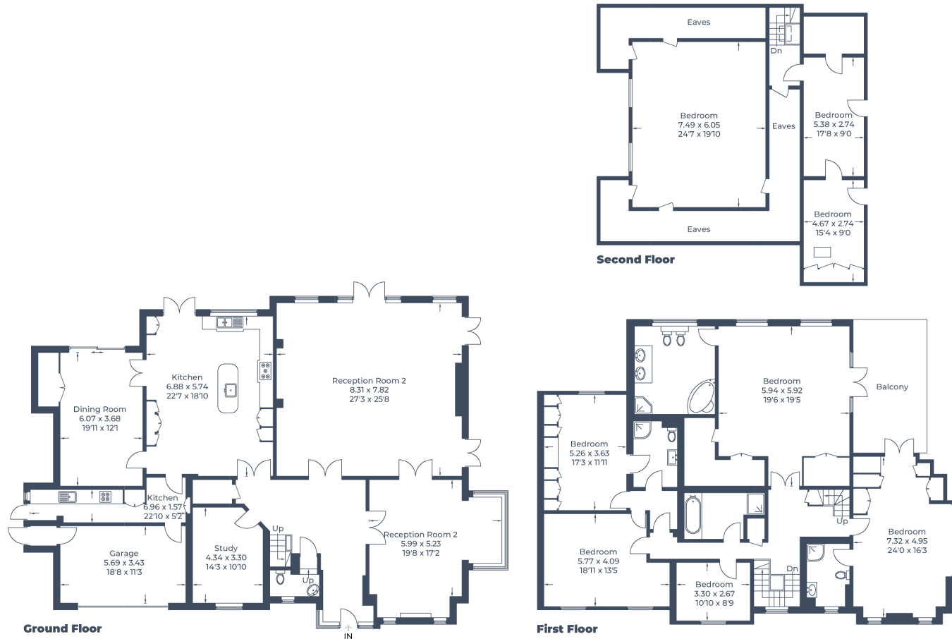
Illustration for identification purposes only, measurements are approximate, not to scale. Produced for Robsons