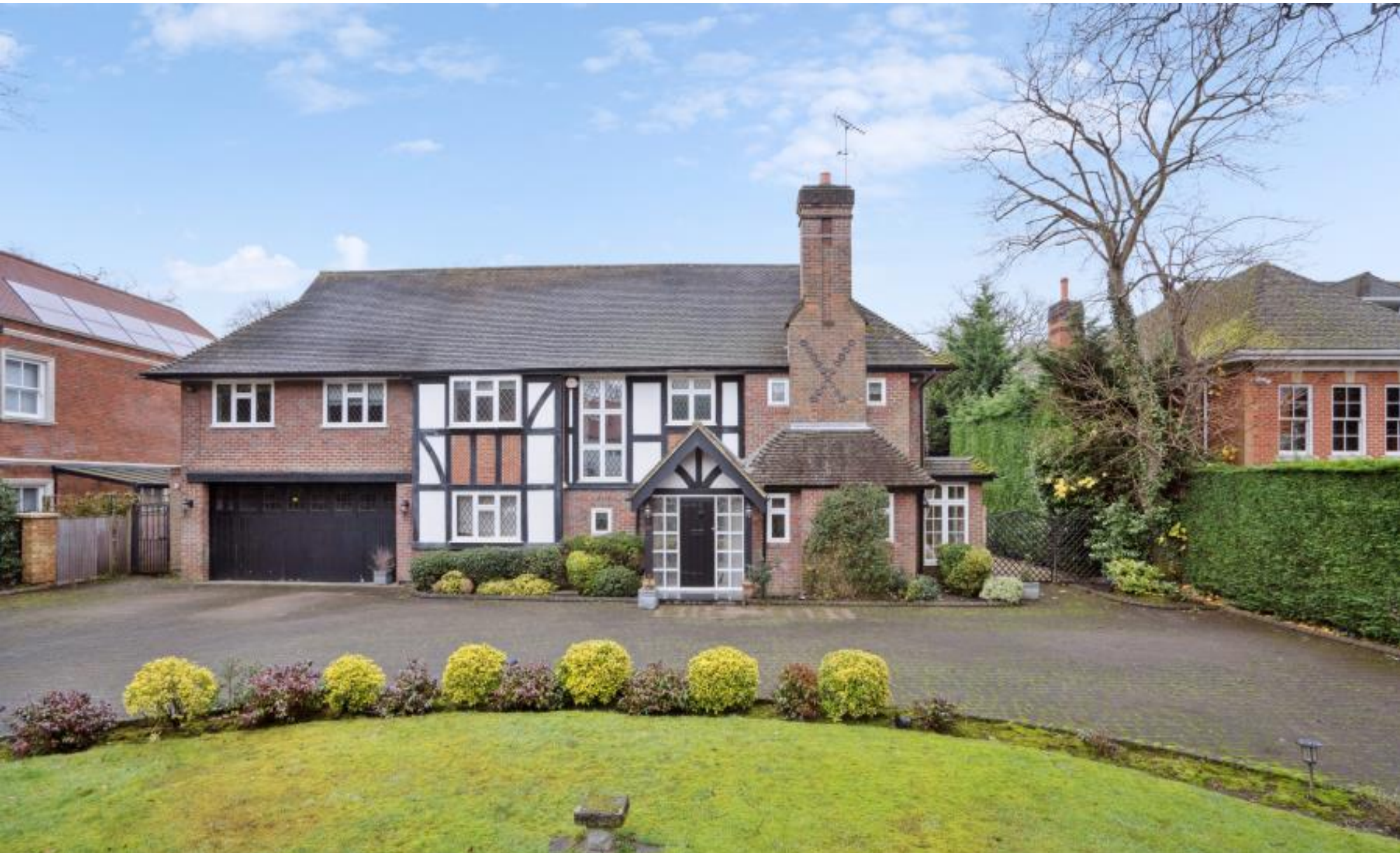
An impressive detached family home in a sought after location Linksway, Northwood, Middlesex HA6 2XA