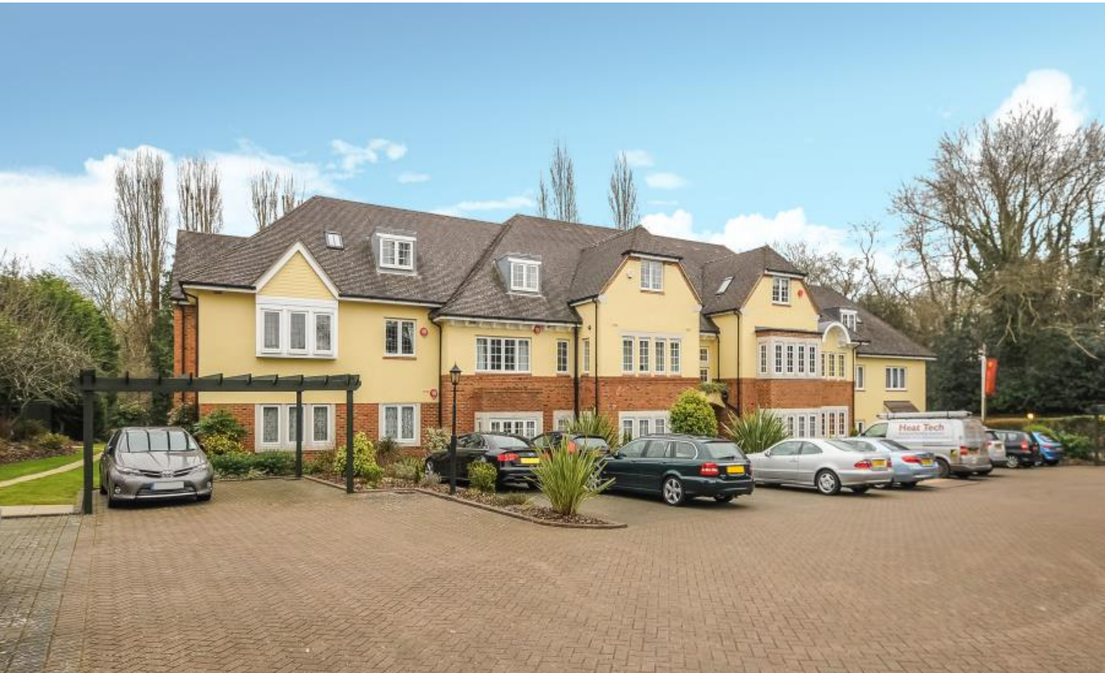
A generous three bedroom, two bathroom first floor apartment Marchbank House, Northwood, Middlesex HA6 2SG