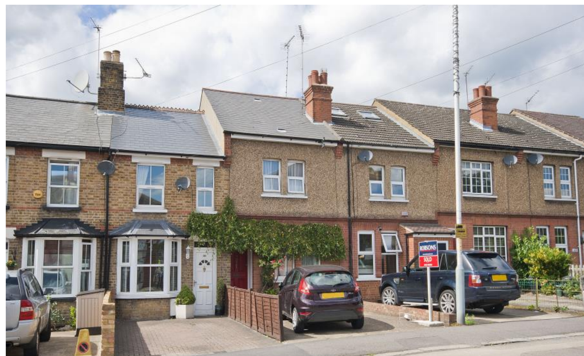
A charming two double bedroom mid-terrace character cottage High Street, Northwood, Middlesex HA6 1ED