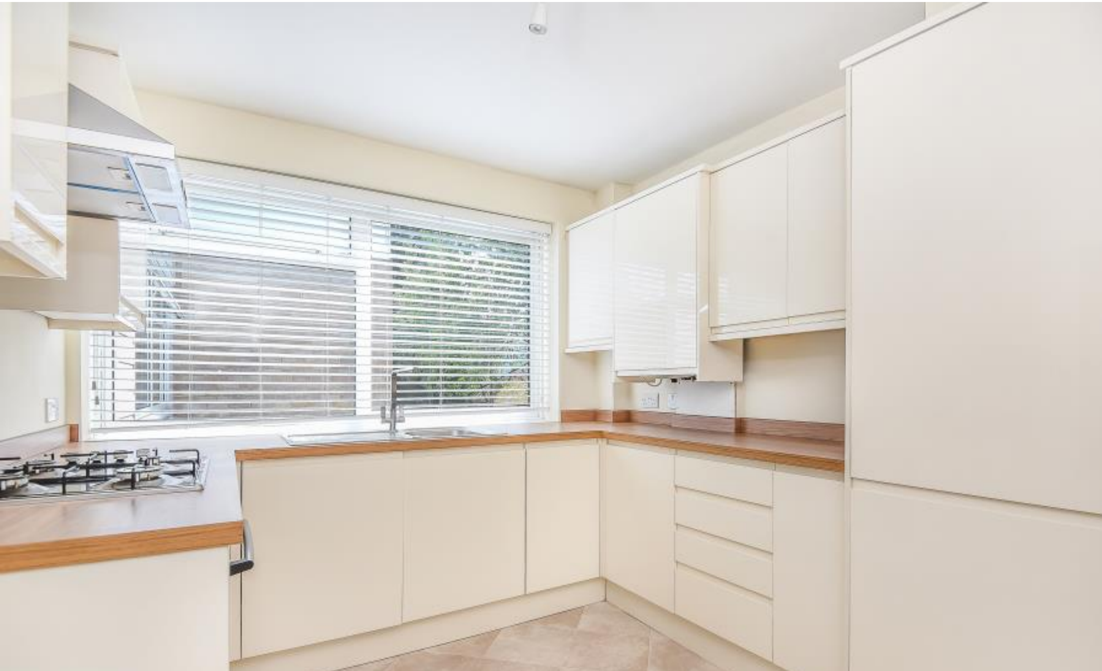
A purpose built two bedroom first floor apartment Fairacre Court, Northwood, Middlesex HA6 2YH