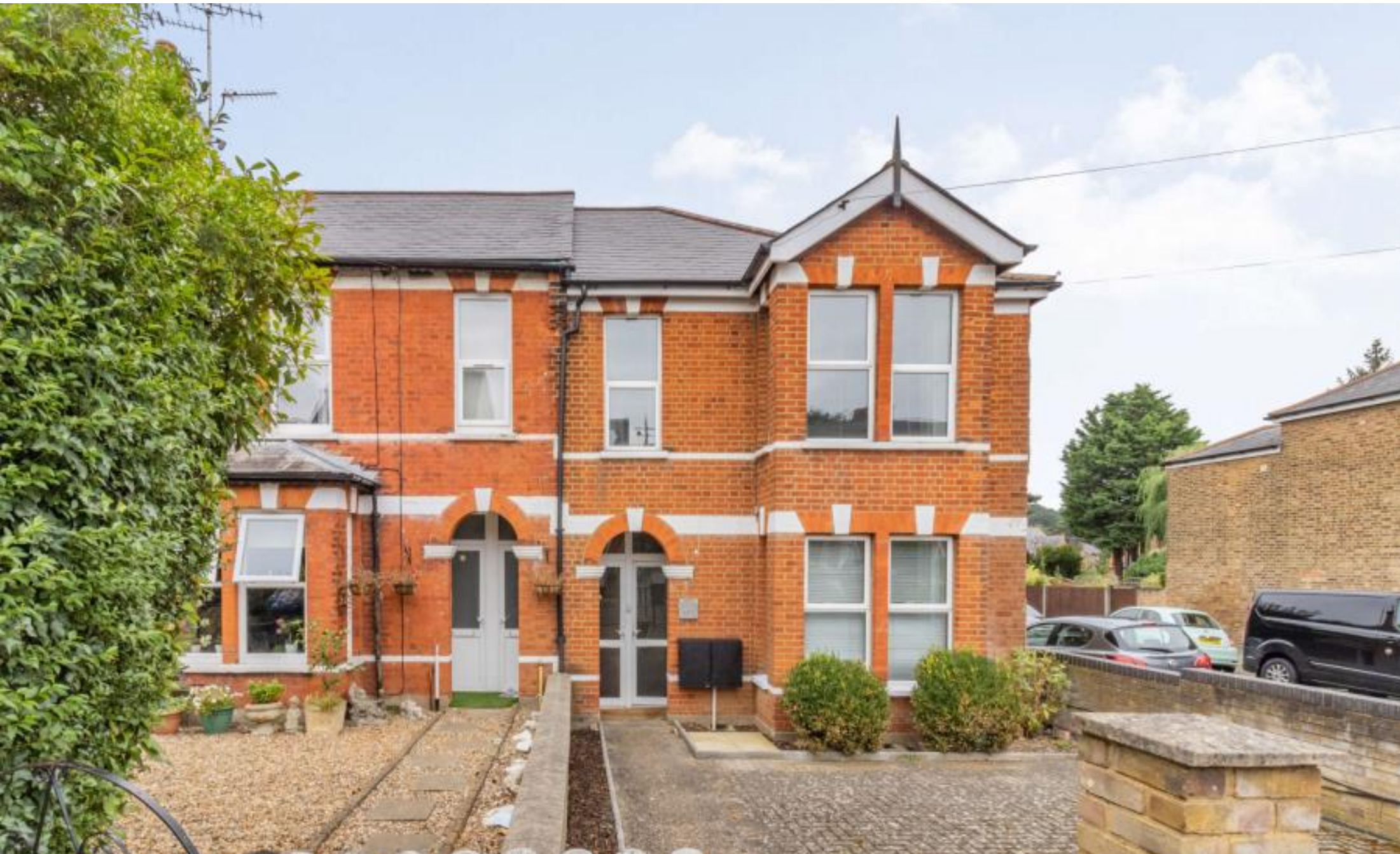
A well presented furnished ground floor two bedroom flat Hallowell Road, Northwood, Middlesex HA6 1DY