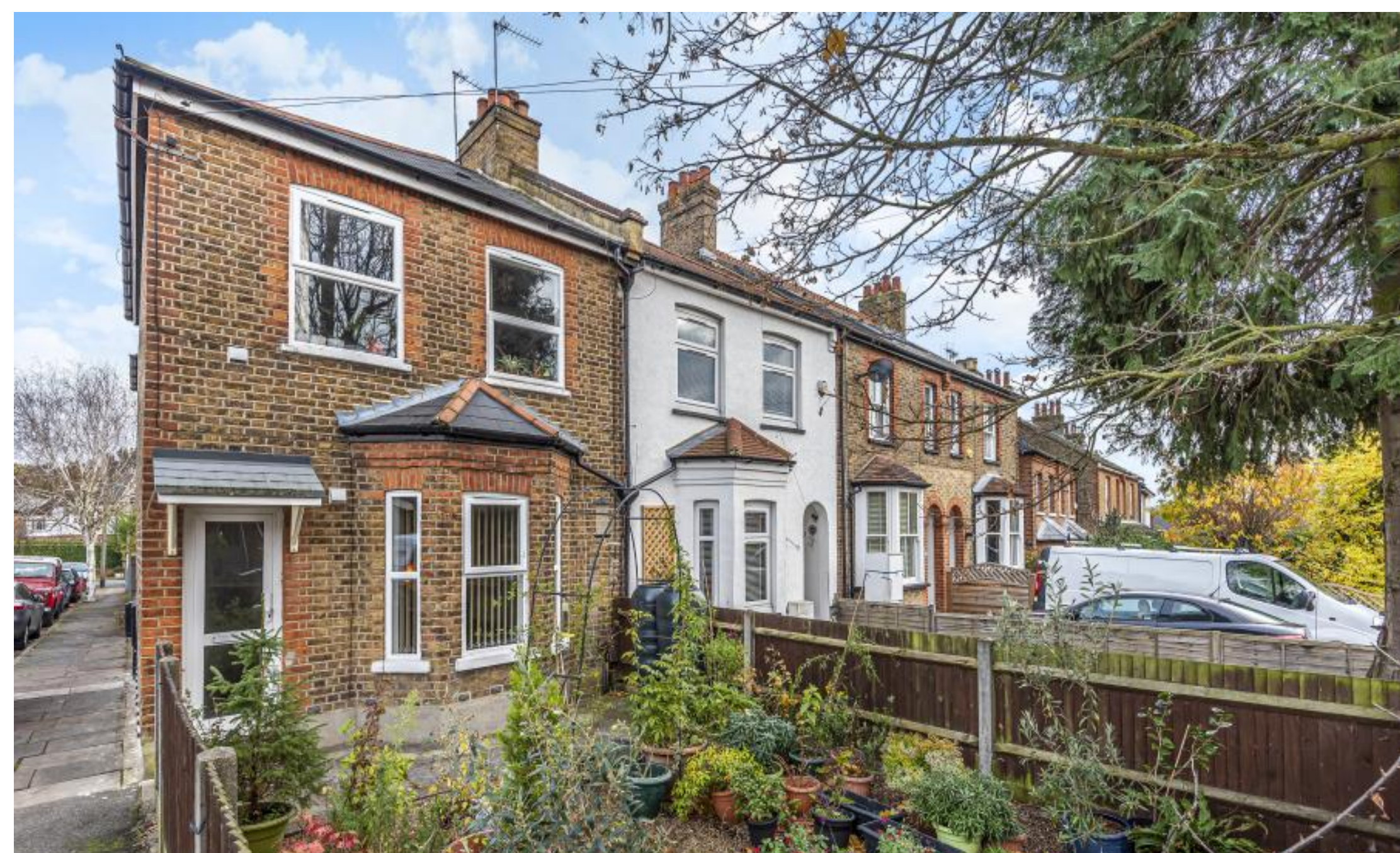
A modern and superbly positioned one bedroom ground floor garden maisonette Hallowell Road, Northwood, Middlesex HA6 1DZ