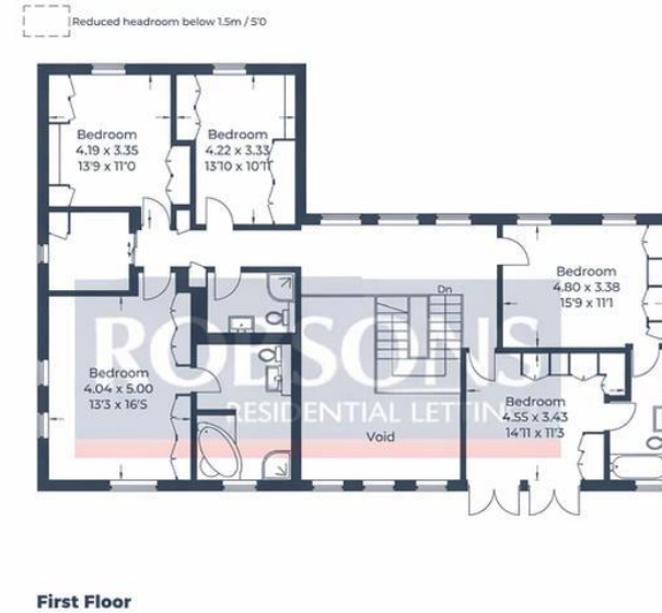
Illustration for identification purposes only, measurements are approximate, not to scale. Produced for Robsons