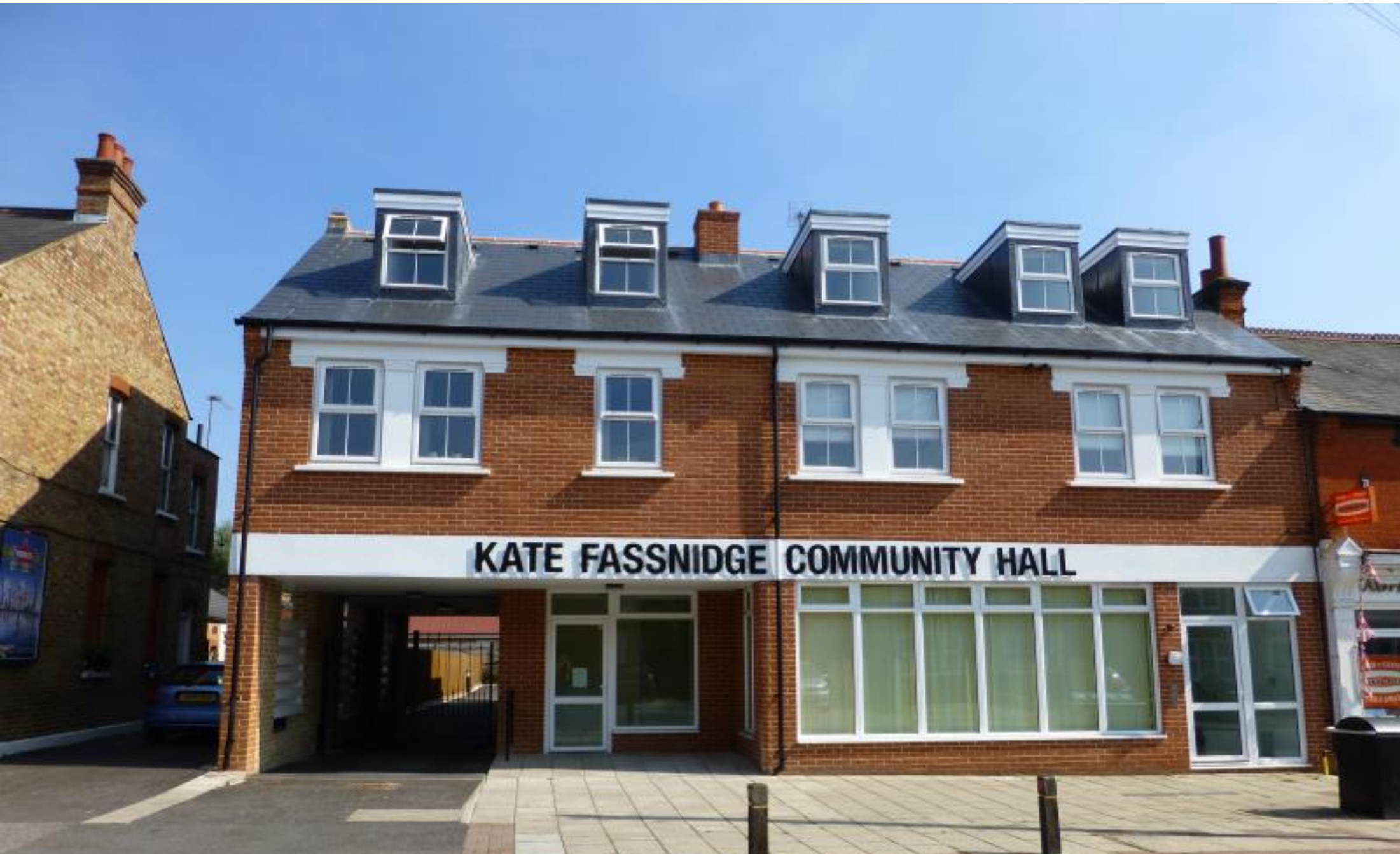
A modern one bedroom first floor apartment High Street, Northwood, Middlesex HA6 1BJ