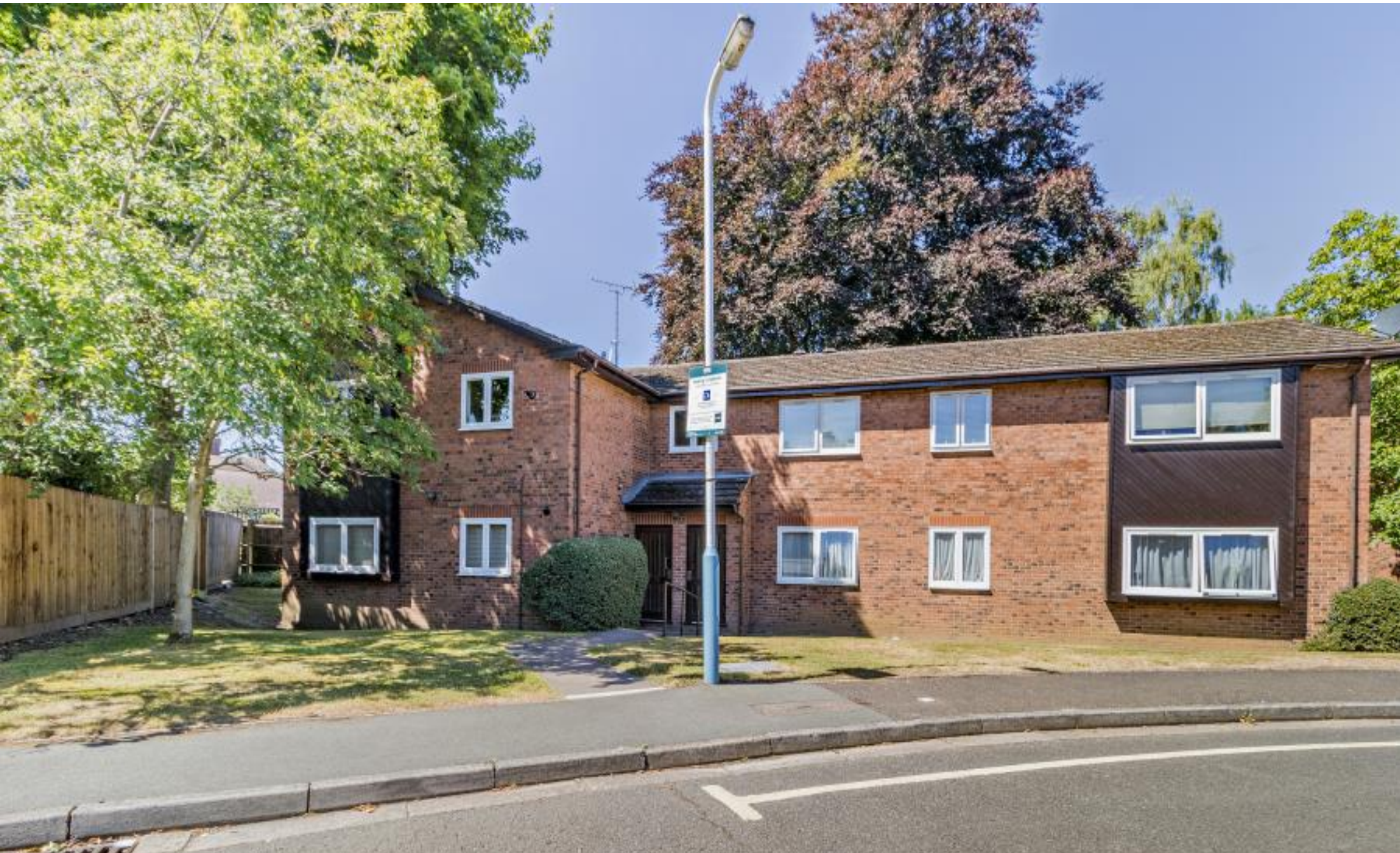
A one bedroom ground floor apartment in a convenient location for amenities Anthus Mews, Northwood, Middlesex HA6 2GX