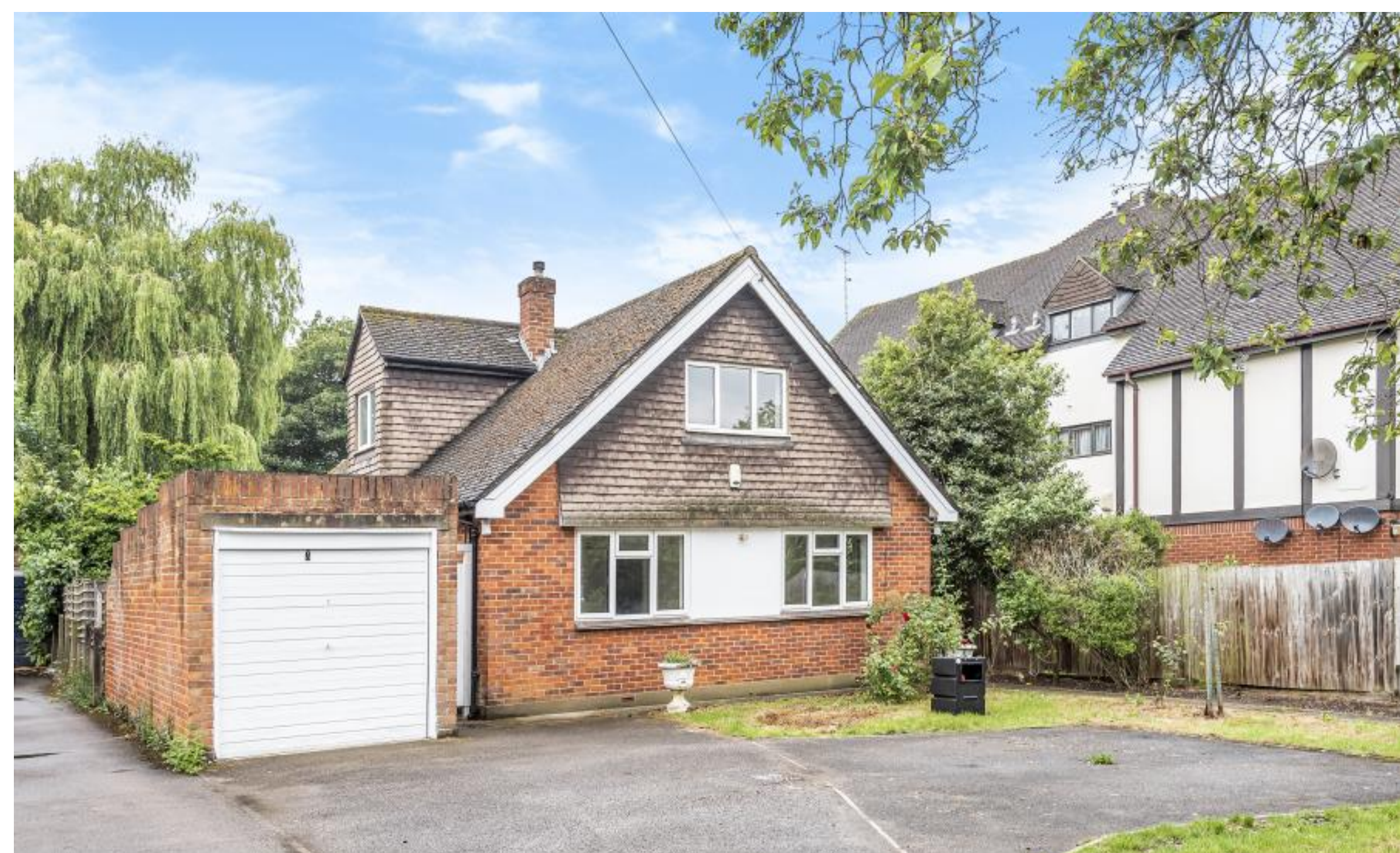
A very bright and spacious four bedroom chalet bungalow Murray Road, Northwood, Middlesex HA6 2YJ