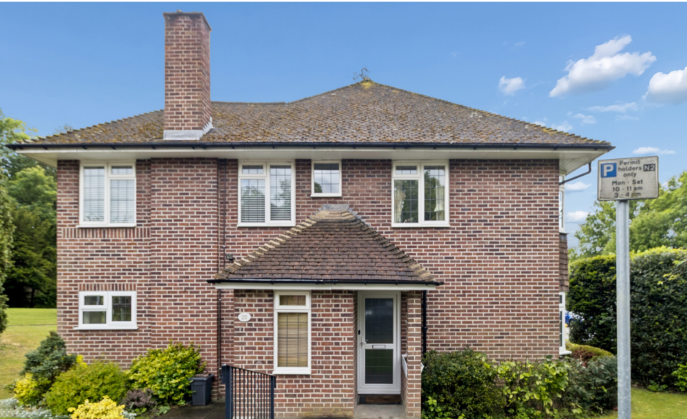
A beautifully renovated three bedroom ground floor maisonette The Glen, Northwood, Middlesex HA6 2UP