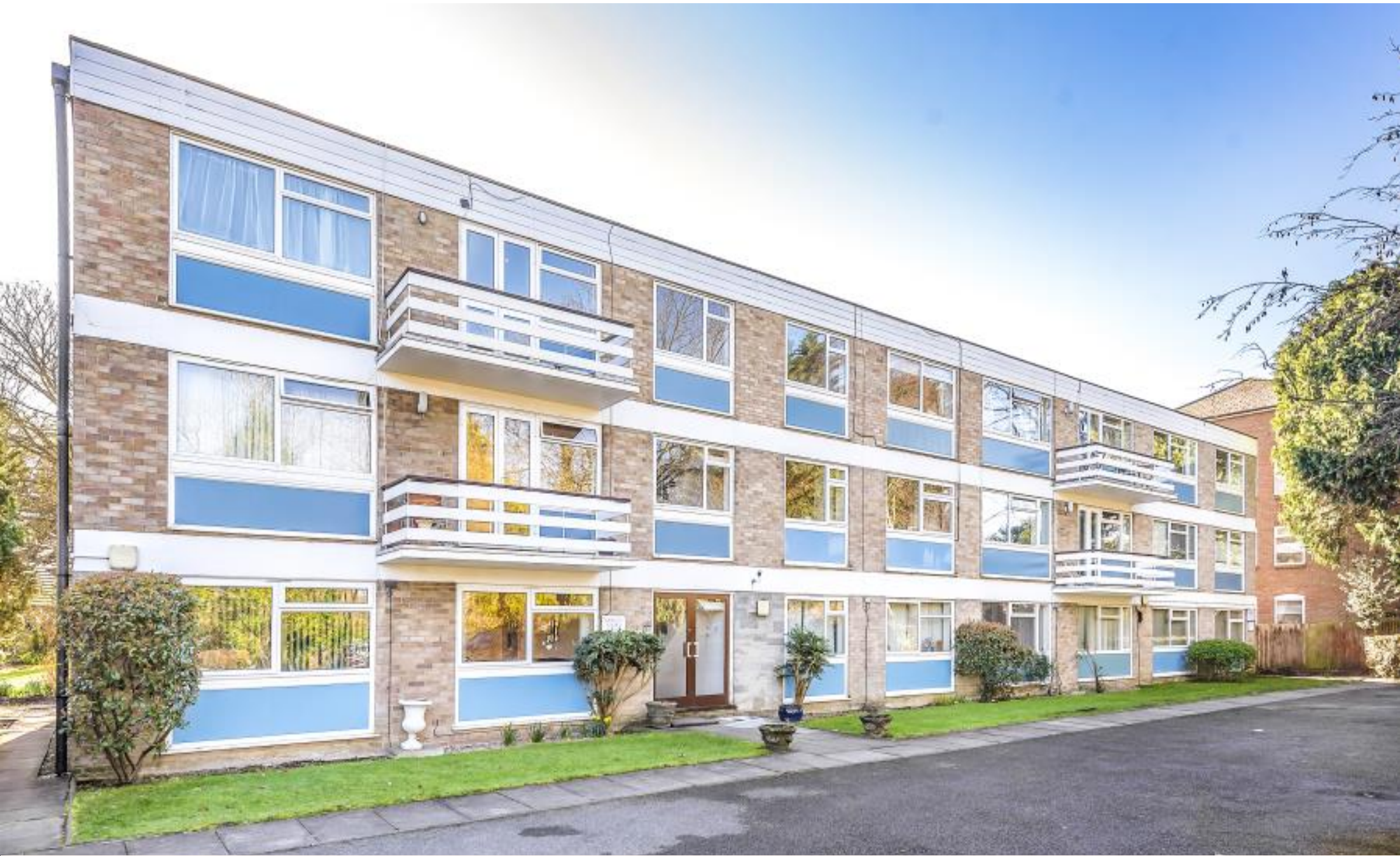
A purpose built two bedroom ground floor apartment Fairacre Court, Northwood, Middlesex HA6 2YH