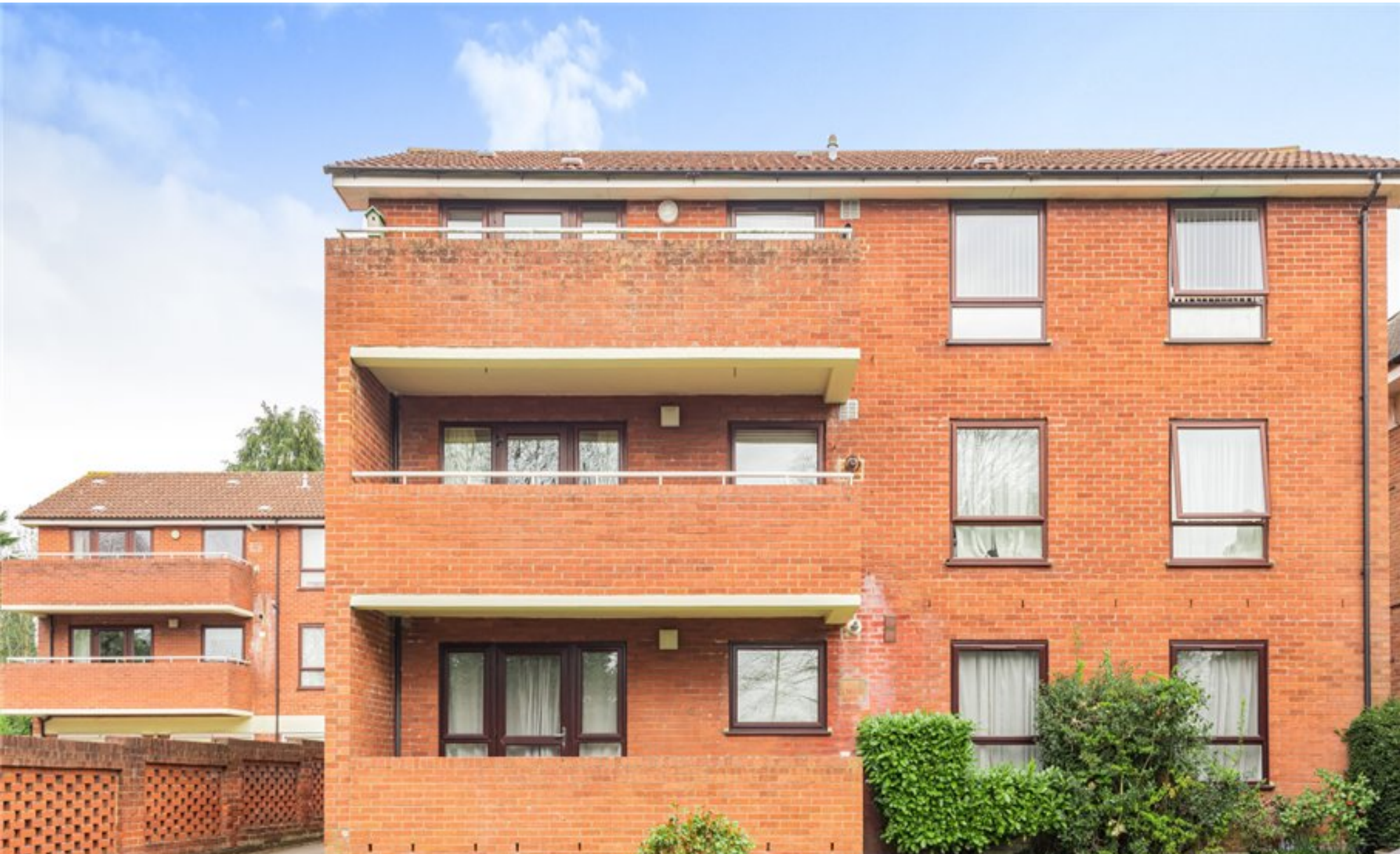
A recently refurbished bright and spacious two bedroom apartment Churchill Court, Northwood, Middlesex HA6 2RY