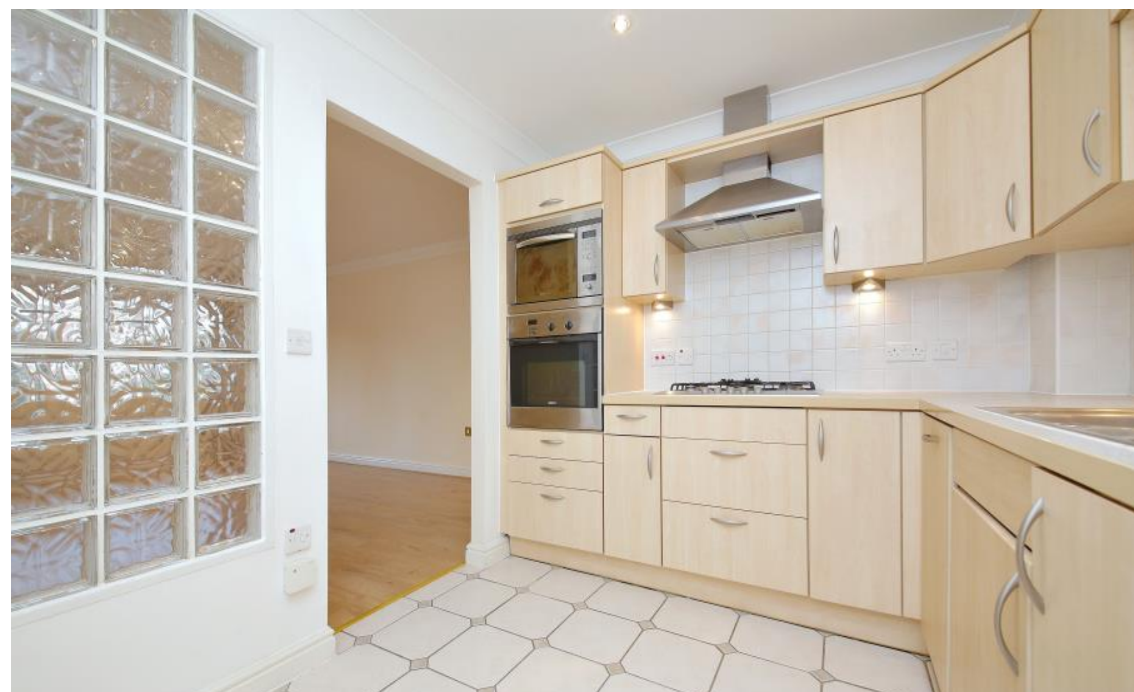
An attractive two bedroom, two bathroom purpose built first floor flat Marchbank House, Northwood, Middlesex HA6 2SG