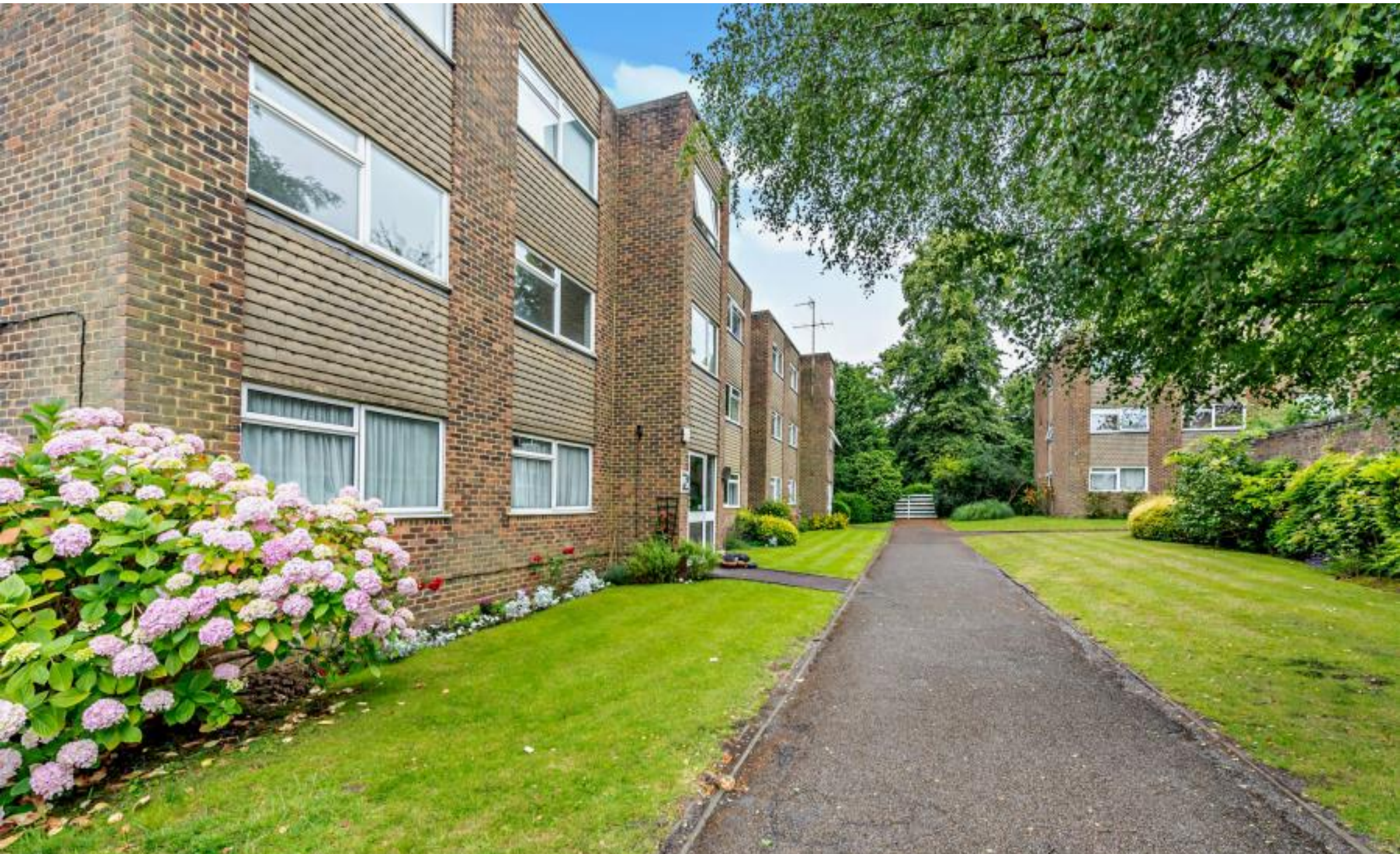
A two bedroom first floor apartment in a convenient location Cedar Place, Northwood, Middlesex HA6 2RW