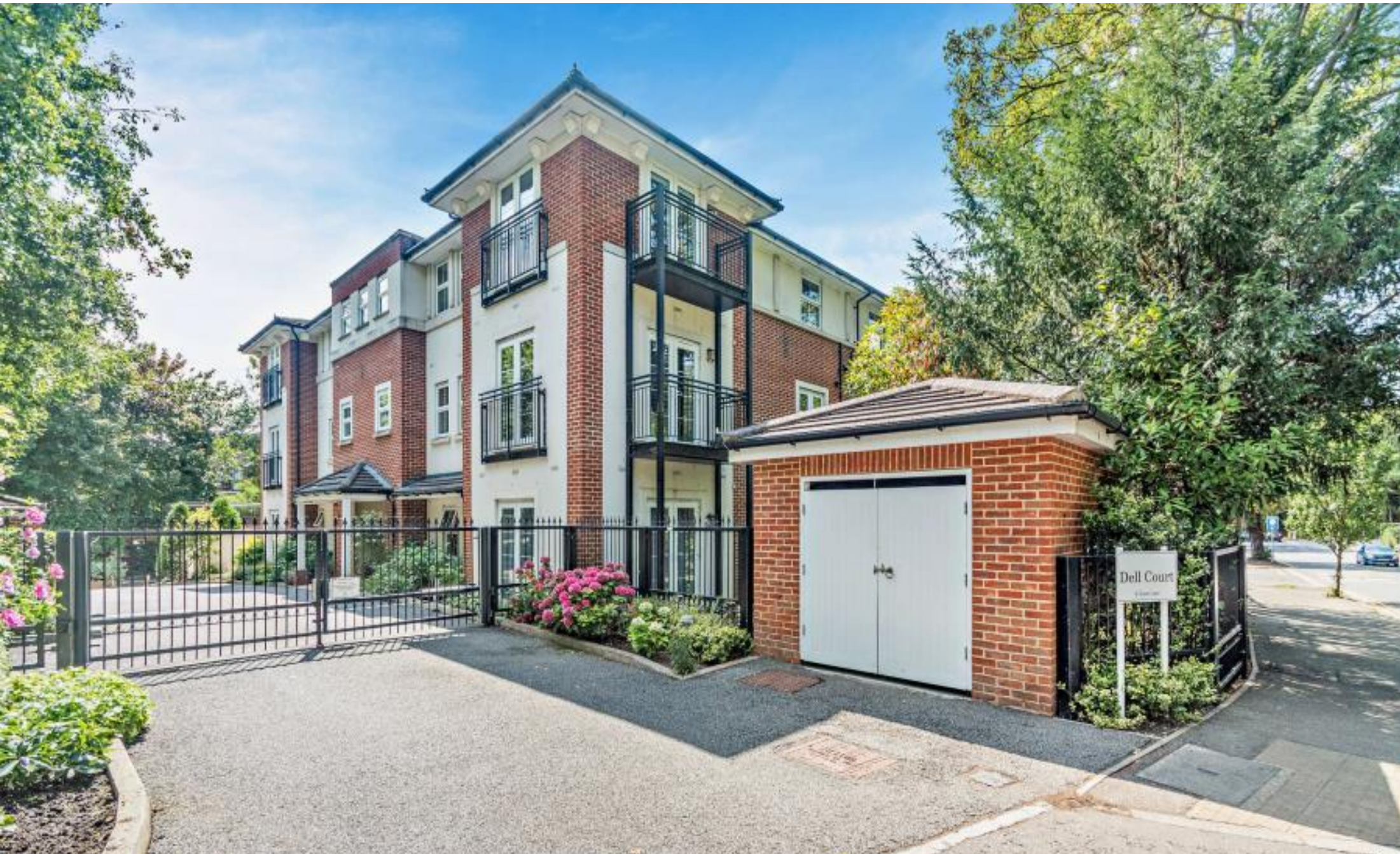
A two bedroom two bathroom apartment in a gated development Dell Court,Northwood, Middlesex HA6 2UT