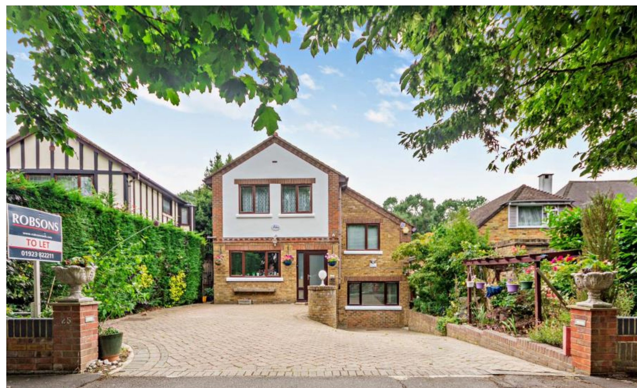
A detached four bedroom, four bathroom house located on this sought after road. Cheney Street, Pinner, Middlesex HA5 2TG