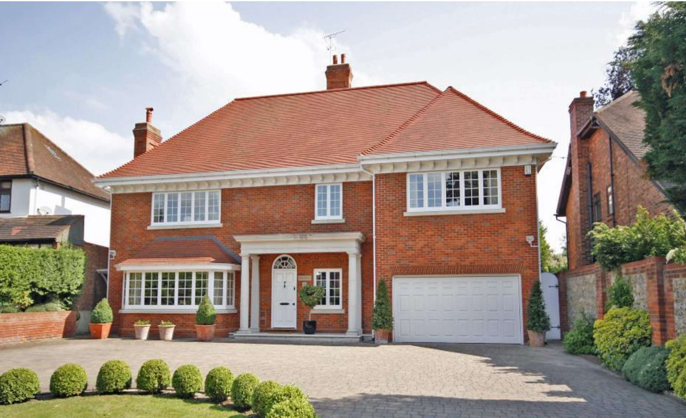
A luxury home situated on a gated private road Kewferry Drive, Northwood, Middlesex HA6 2PA